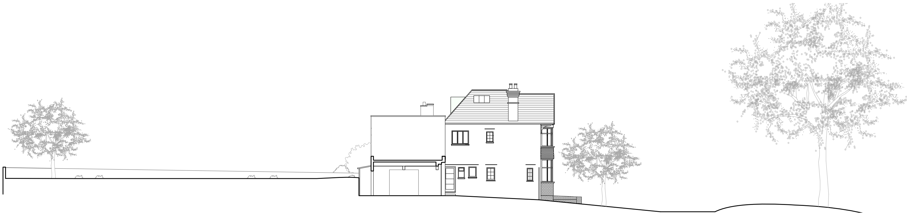
Side Elevation B- 1:200