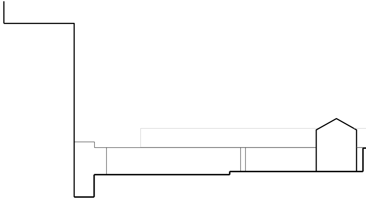
EXISTING WEST FACING ELEVATION

LVH Architects accepts no liability for either: any such alterations and/or additions to the background information by others; or any other changes made to the architectural content of the background information made by others.