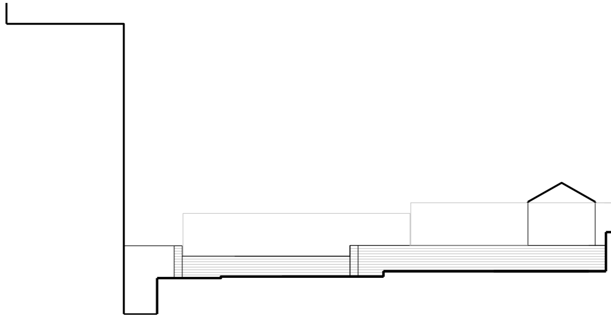
EXISTING WEST FACING ELEVATION