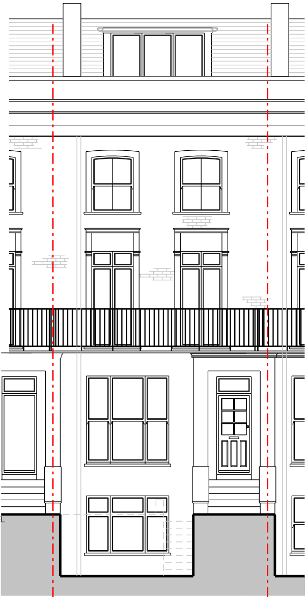
EXISTING NORTH FACING ELEVATION