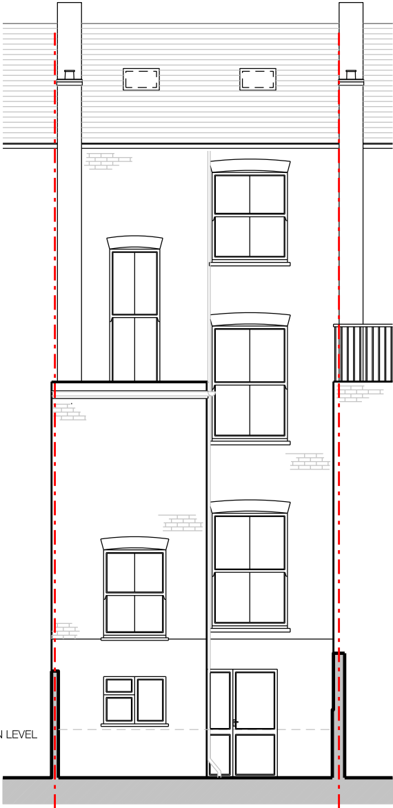
EXISTING SOUTH FACING ELEVATION