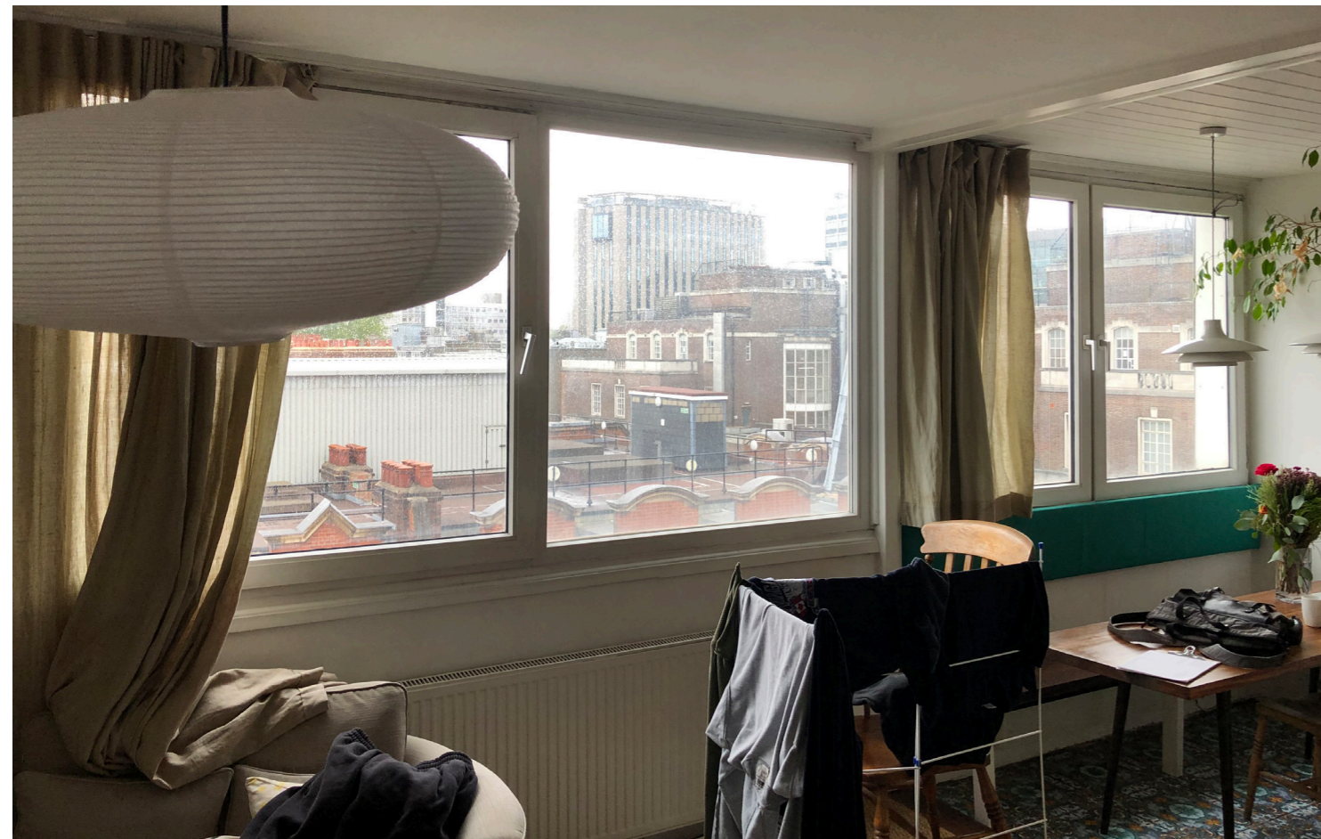
Interior view of existing windows