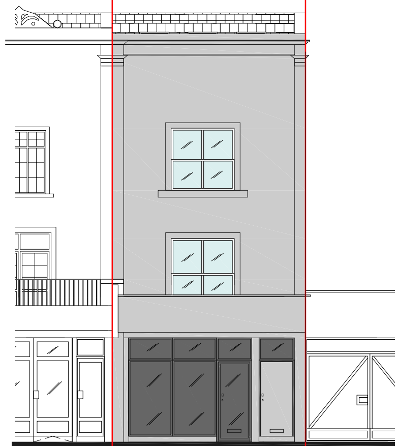
FRONT ELEVATION EXISTING SCALE 1:100