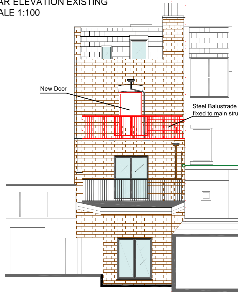
REAR ELEVATION EXISTING SCALE 1:100