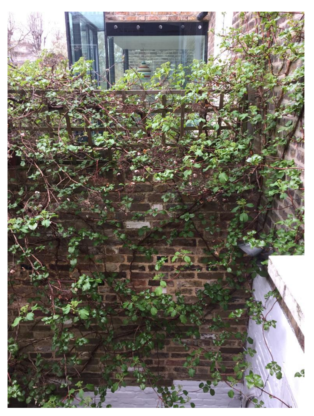
View of party wall from existing external stair access