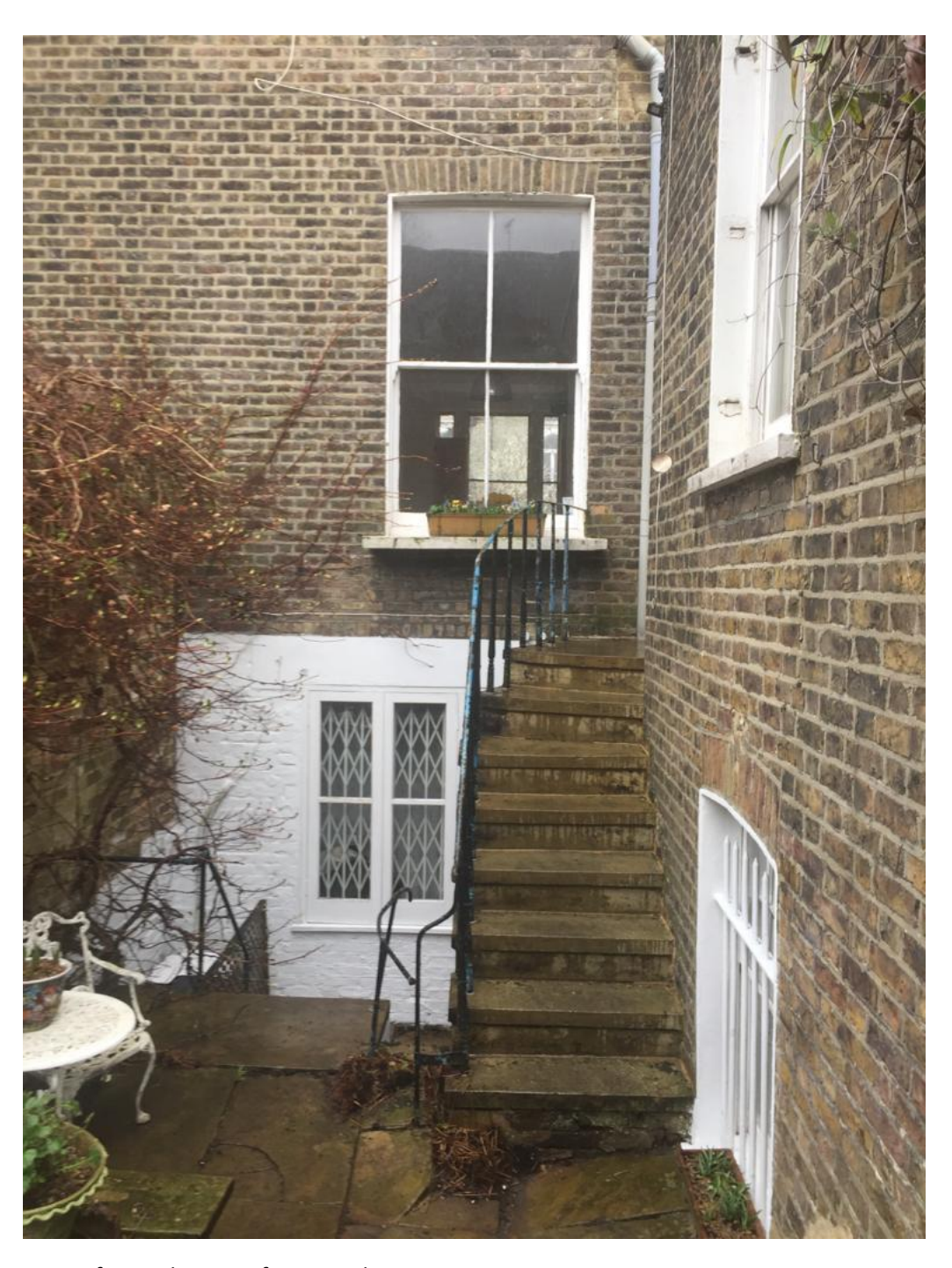
View of rear elevation from Garden