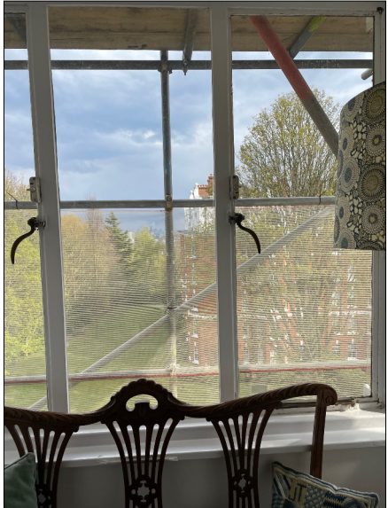
W1 and W3 Front Window