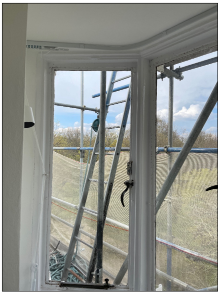
W1 and W3 Side Window