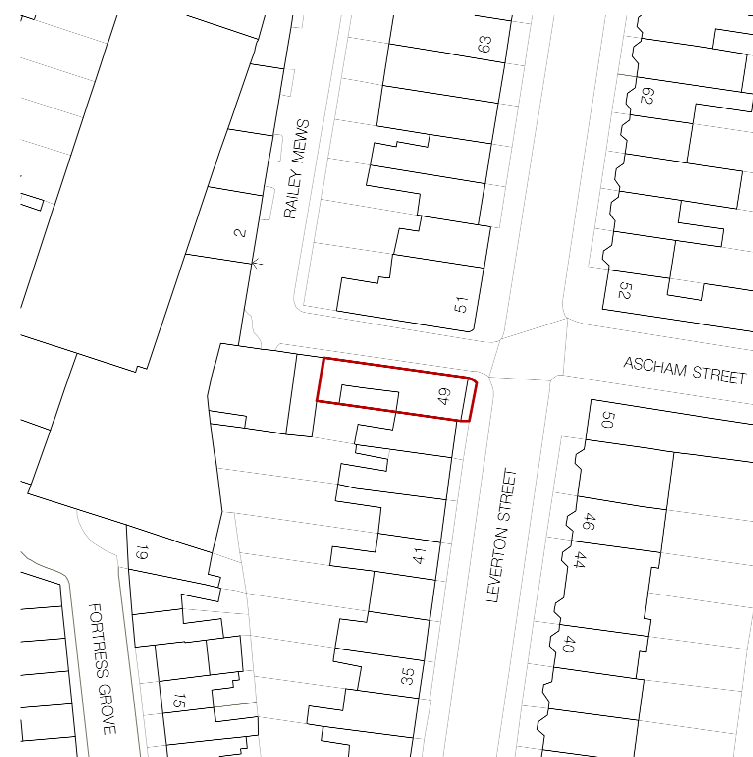
2 site plan 1:500