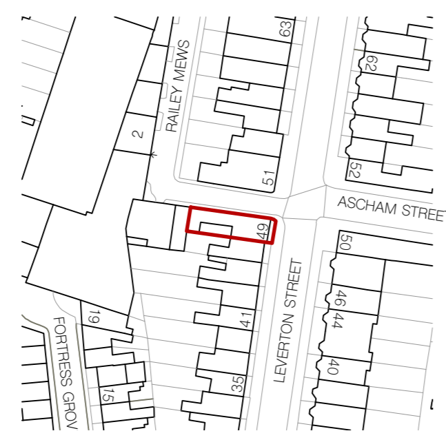
1 location plan 1:1250