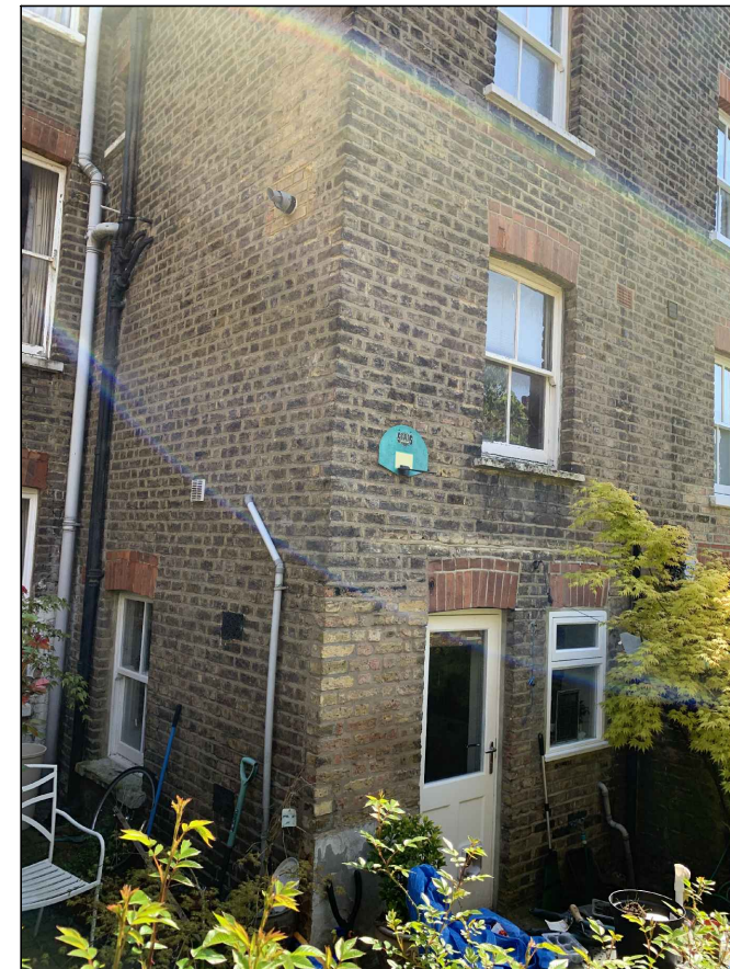
View towards no 45