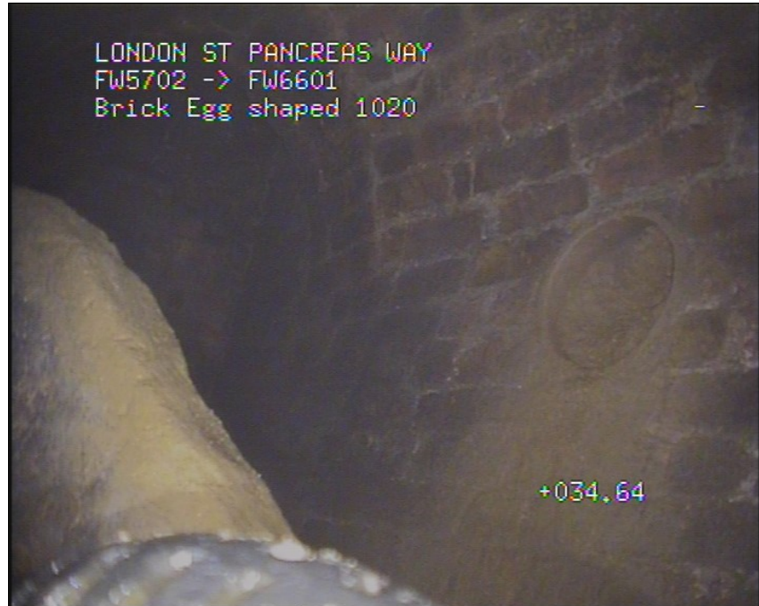
Photo: 4_4_41_A.JPG 34.64m, General remark