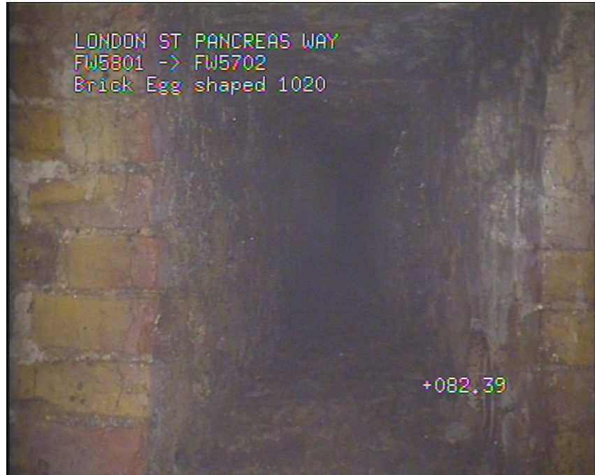
Photo: 3_3_32_A.JPG 82.39m, General remark