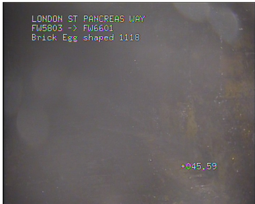
Photo: 1_1_21_A.JPG 45.59m, General remark