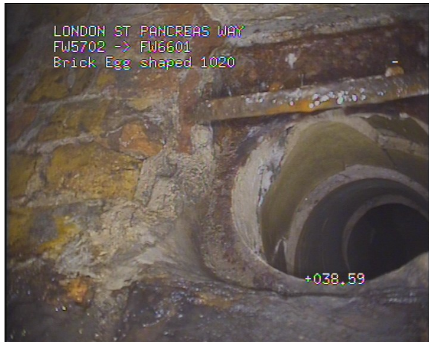
Photo: 4_4_42_A.JPG 38.49m, Connection defective, connecting pipe is damaged, at 3 o'clock, diameter 150mm