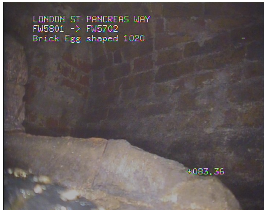
Photo: 3_3_33_A.JPG 83.36m, General remark