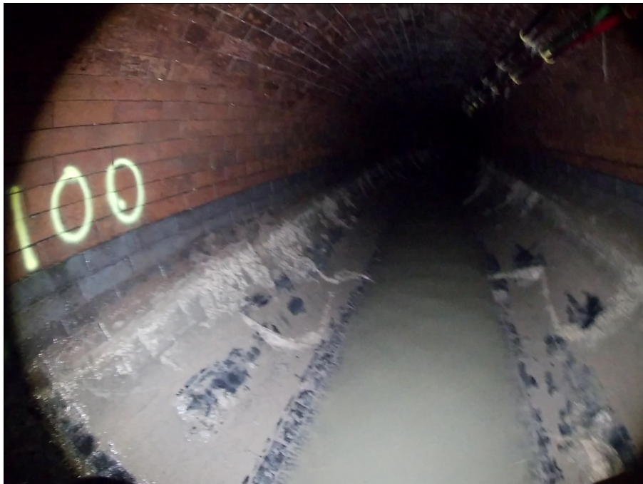
Photo: 3_3_59_A.jpg, Media No.: 42774, 00:04:19 100m, General photograph taken at this point Remarks: 100 METERS