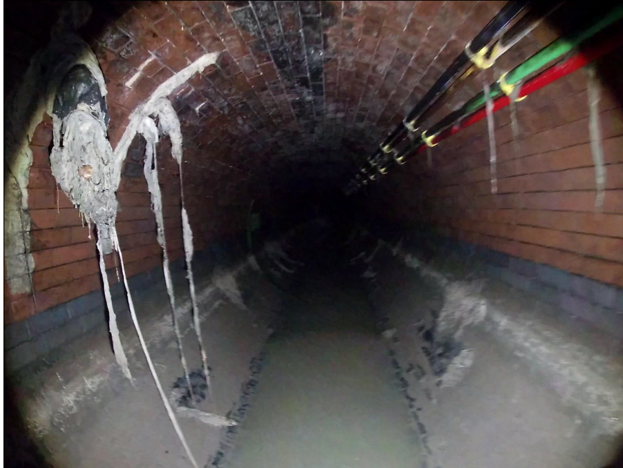
Photo: TQ29835701_D_150619_233500_-_7.jpg, Media No.: 42774, 00:04:01 93m, Attached deposits, encrustation, from 9 to 11 o'clock, 10% cross-sectional area loss