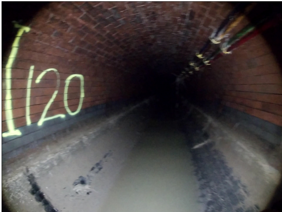
Photo: 3_3_20_A.jpg, Media No.: 42774, 00:05:03 120m, General remark Remarks: REQUIRED METERAGE REACHED