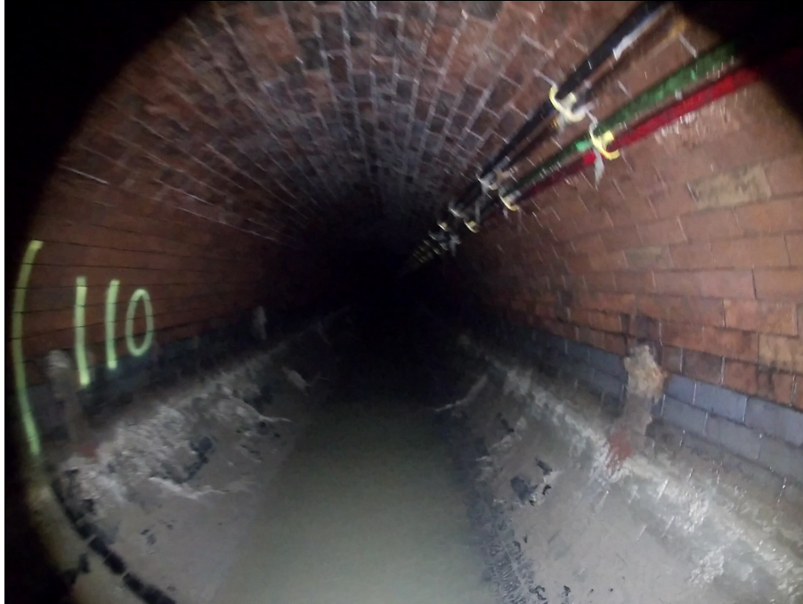
Photo: 3_3_60_A.jpg, Media No.: 42774, 00:04:32 110m, General photograph taken at this point Remarks: 110 METERS