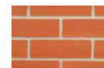
Suffolk Red Stock