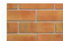
South Downs Multi Stock