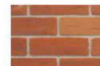
Surrey Red Autumn