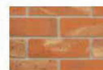
London Multi Stock