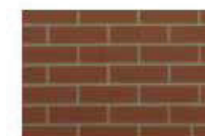
Staffordshire Face Red