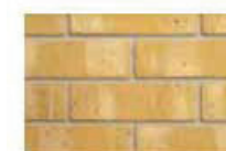
Kent Yellow Stock