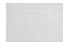
Ashford White Smooth