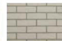
Ashford White Riven