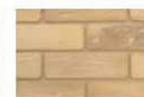
London Sanded Cream