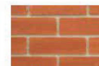
East Midlands Red Stock