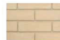
Charnwood Forest Buff