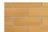
Thames Yellow Stock