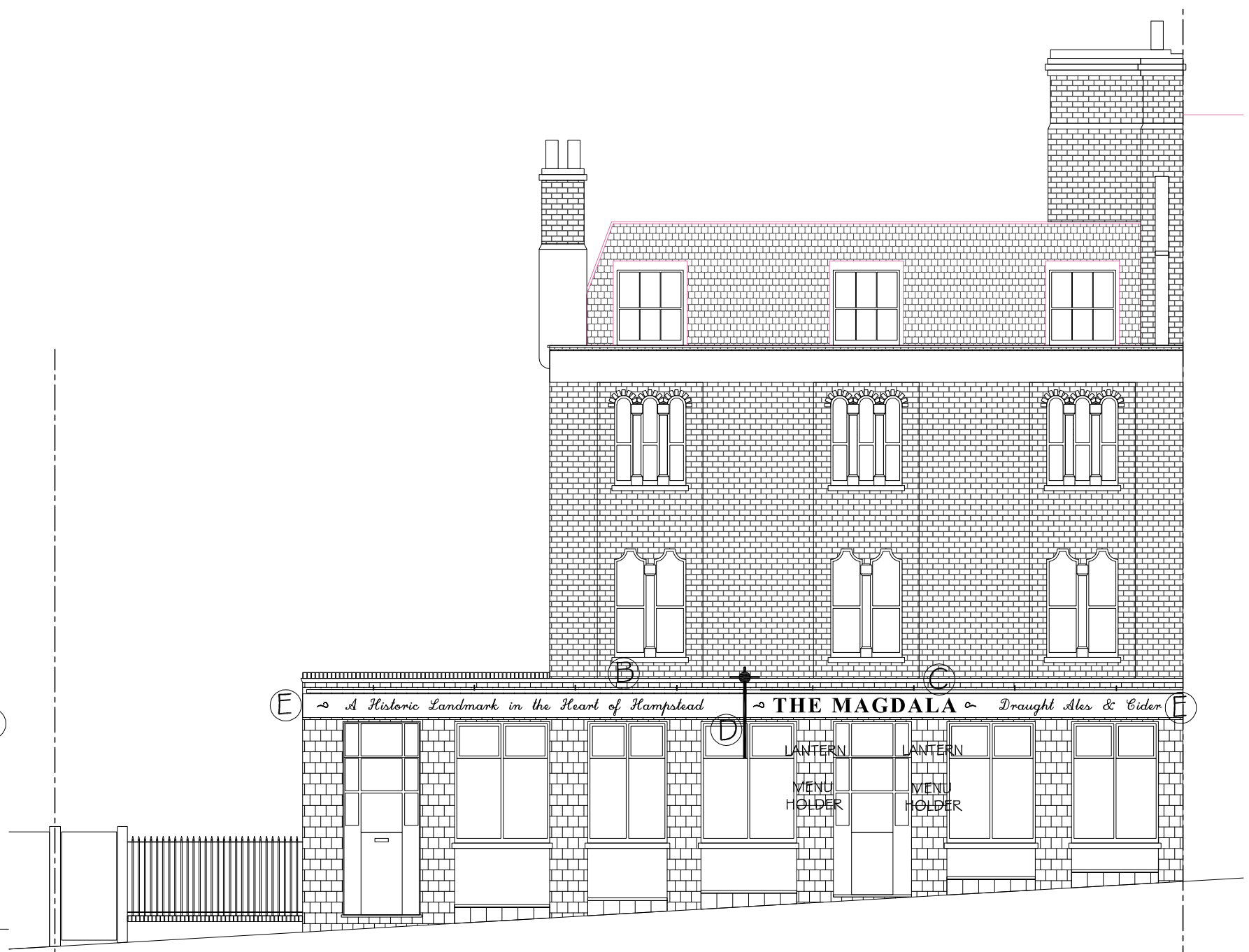
FRONT ELEVATION : Scale: 1:100 @ A3