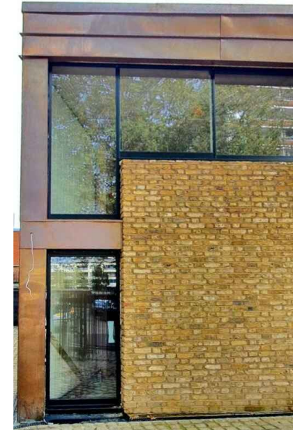
LONDON STOCK YELLOW BRICK COPPER CLADDING BLACK ALUMINIUM WINDOWS