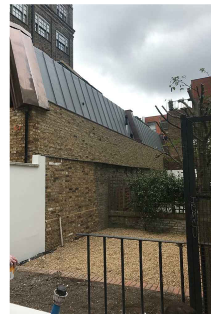
LONDON STOCK YELLOW BRICK COPPER CLADDING SARNAFIL