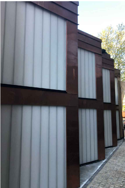
COPPER CLADDING REGLIT GLASS