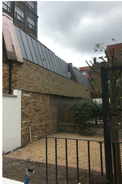
LONDON STOCK YELLOW BRICK COPPER CLADDING SARNAFIL

NOTES DO NOT SCALE FROM THIS DRAWING PLANNING NOTE: This drawing is submitted as part of a planning, listed building or conservation area consent application and is not intended for any other purpose. All plans, sections & elevations are based on measured readings and any scaled dimension should not be relied upon to give an accurate measurement.