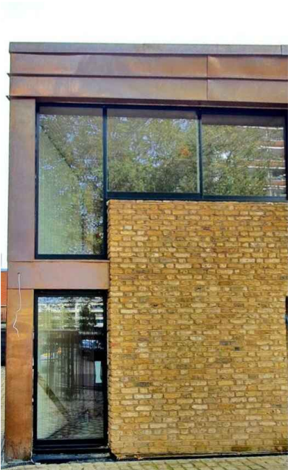
LONDON STOCK YELLOW BRICK COPPER CLADDING BLACK ALUMINIUM WINDOWS