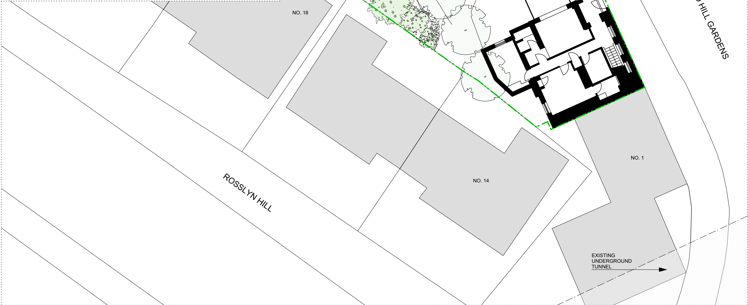
0 2 4 6 8 METRES EXISTING SITE PLAN @ 1:200