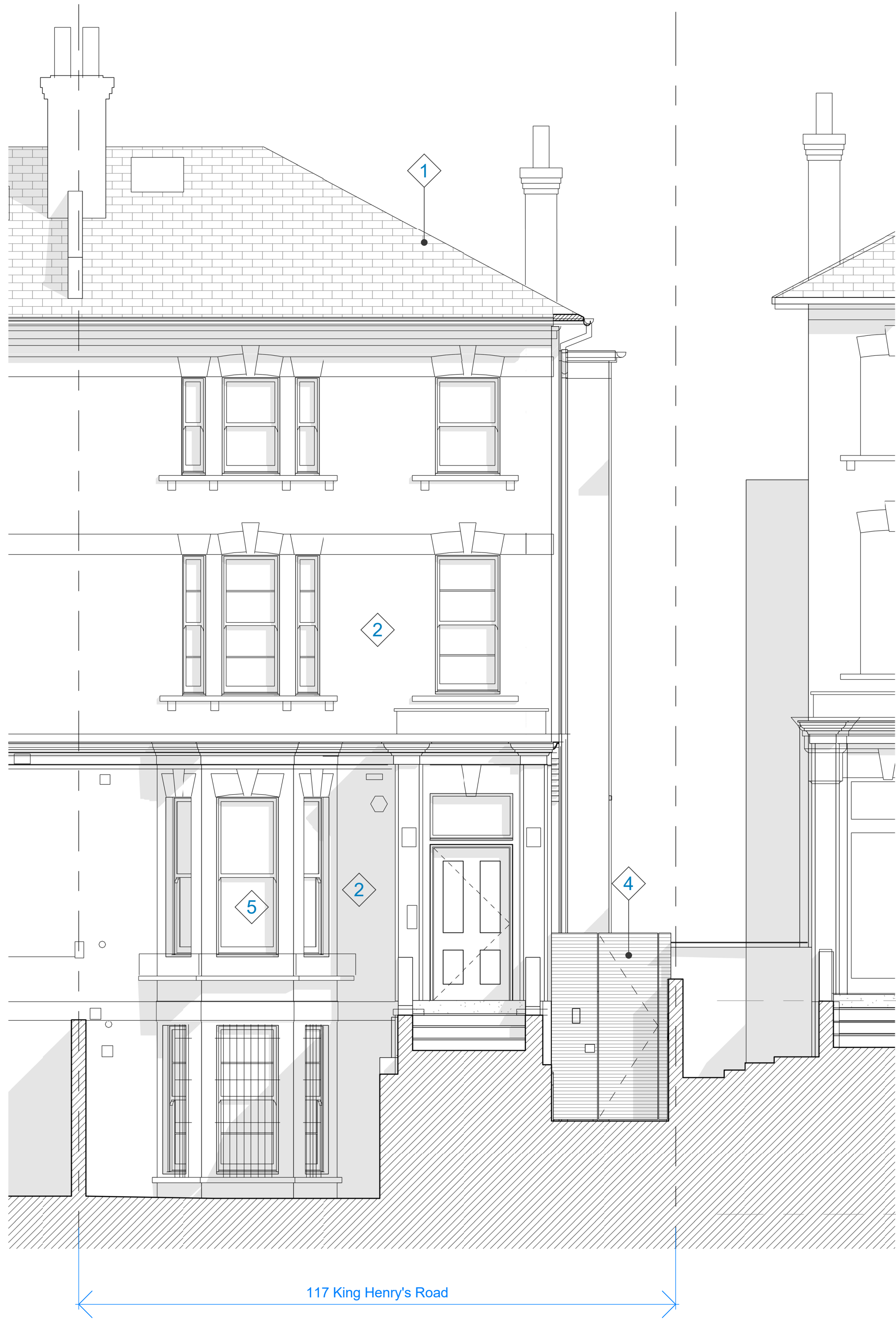
1 Existing North Elevation 1 : 50