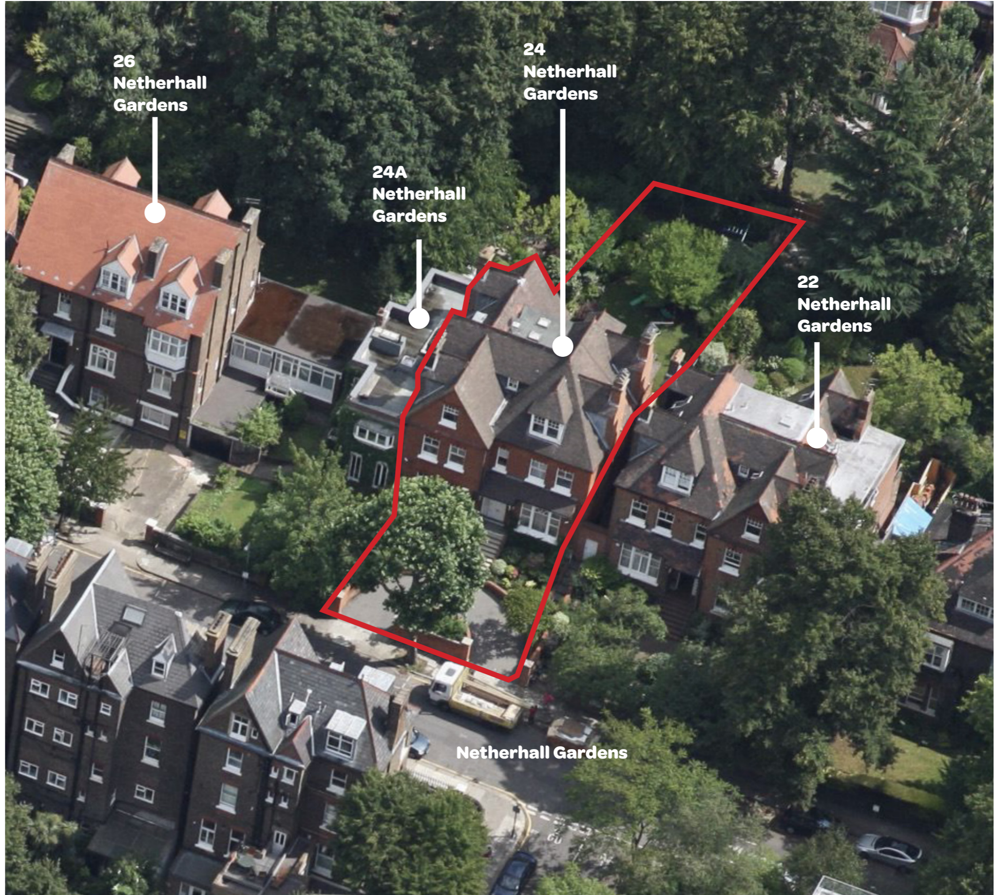
Aerial view of Netherhall Gardens