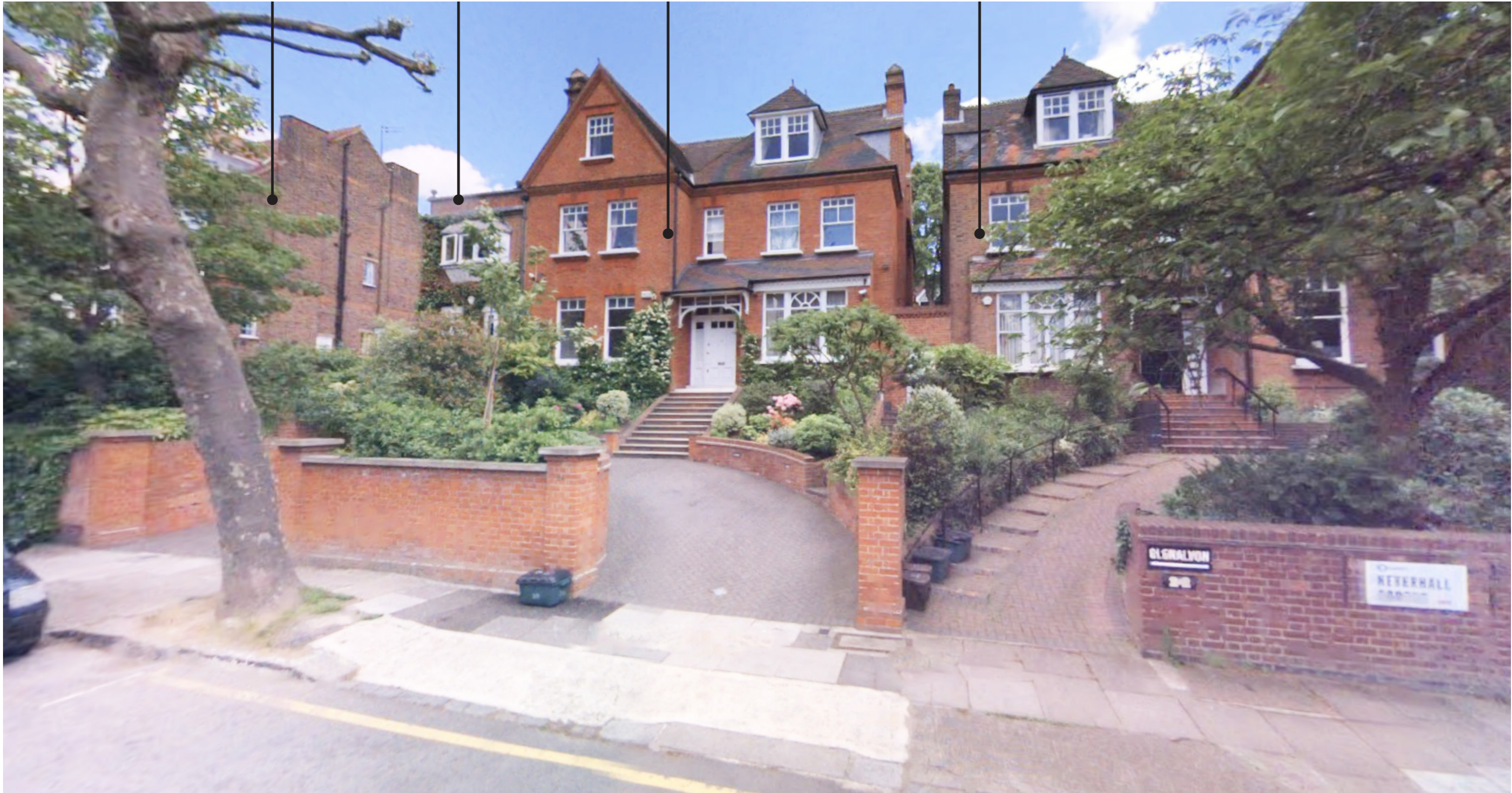
Street view of Netherhall Gardens.