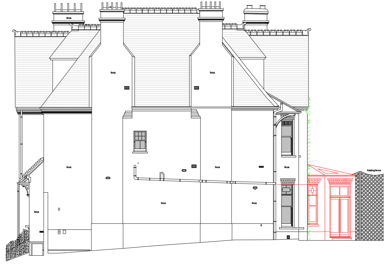
Proposed side elevation