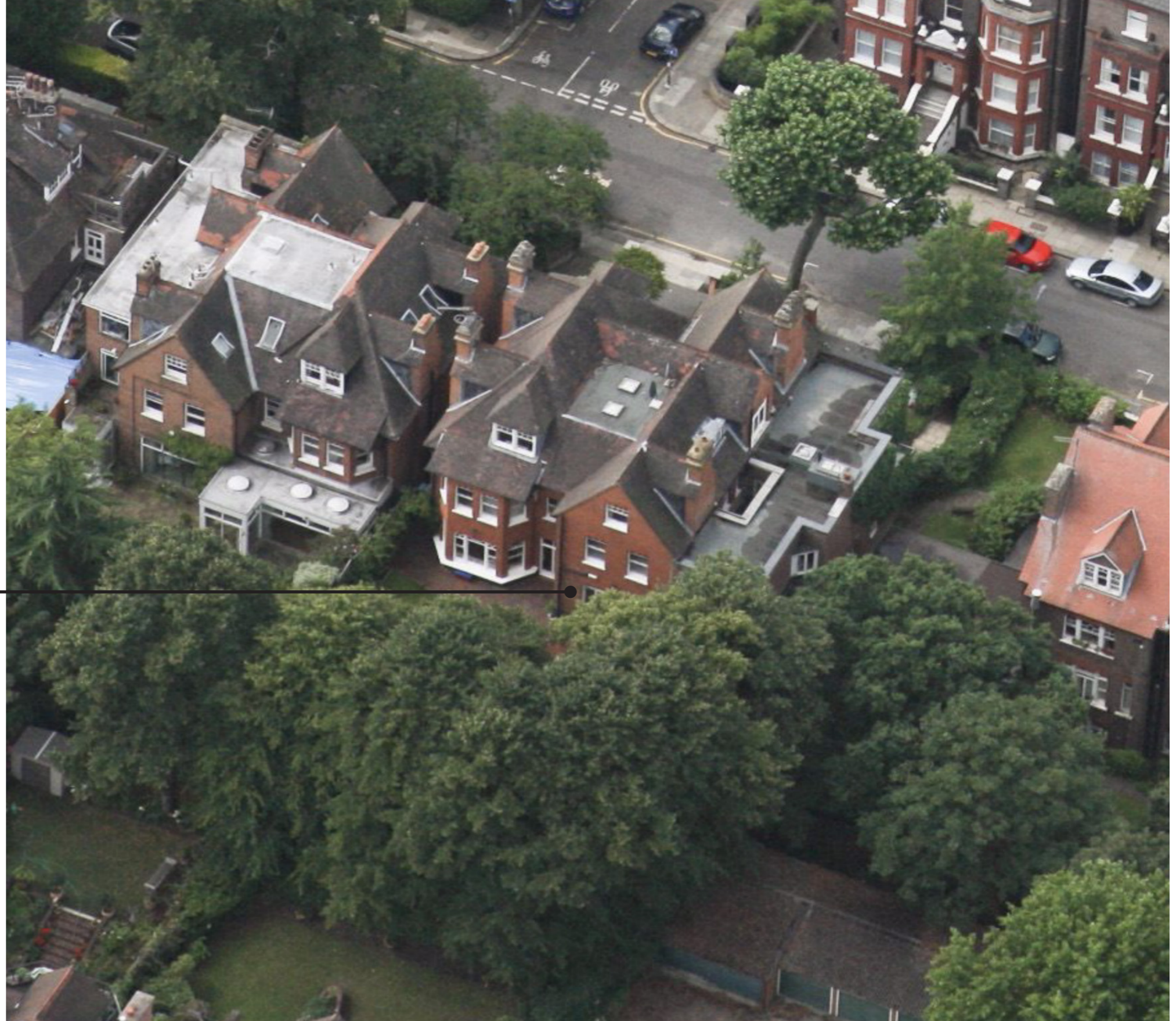
Existing rear facade of 24 Netherhall Gardens.

Area of proposed extension is hidden by existing trees that border the garden.