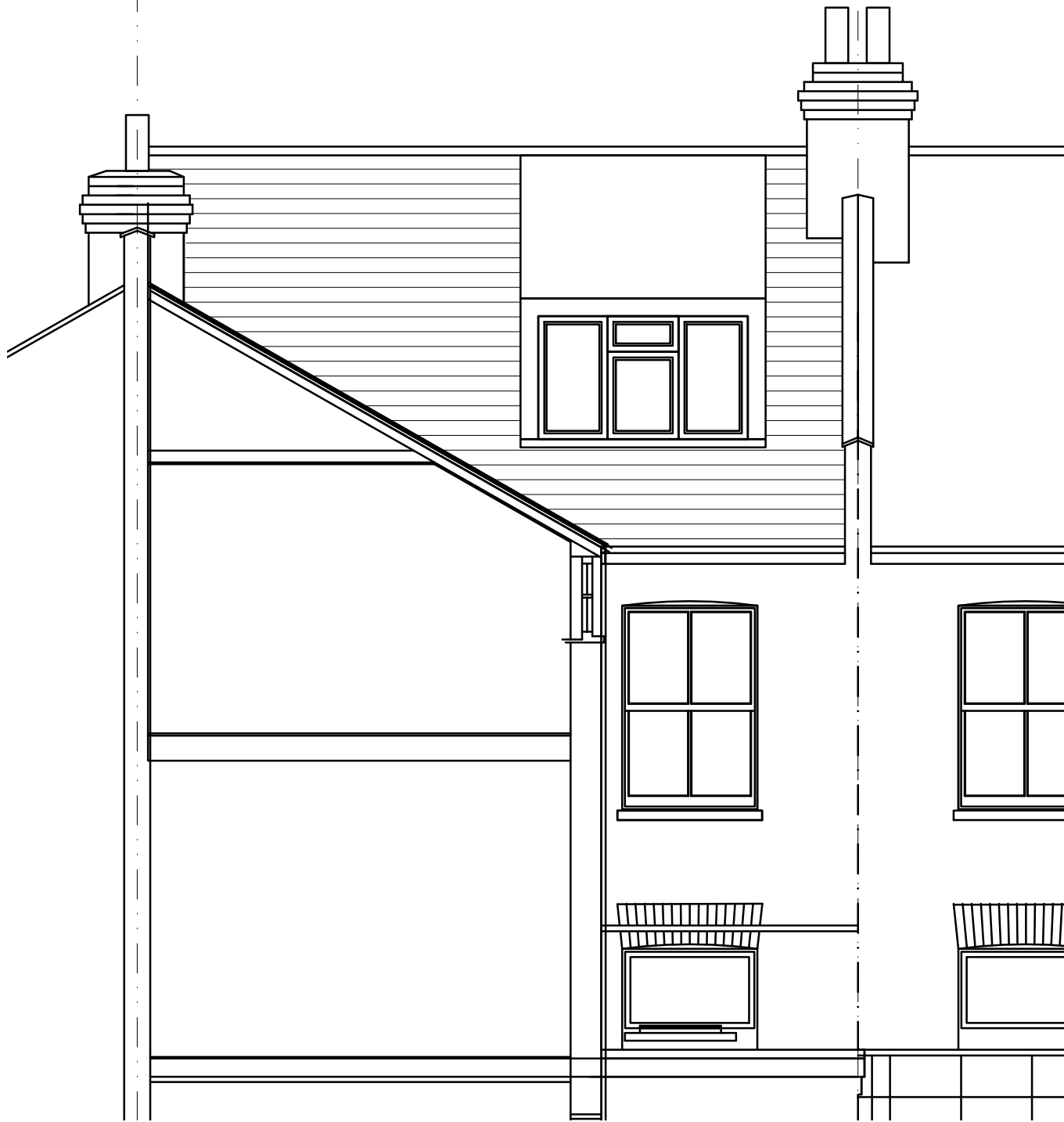
Existing Sectional Elevation