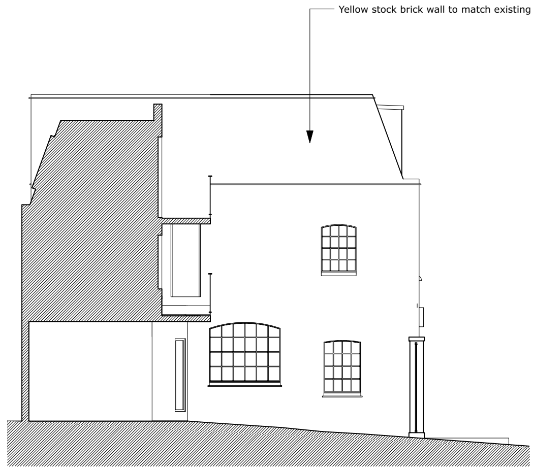
3 Side Elevation As seen from 62a and 62b Highgate Road