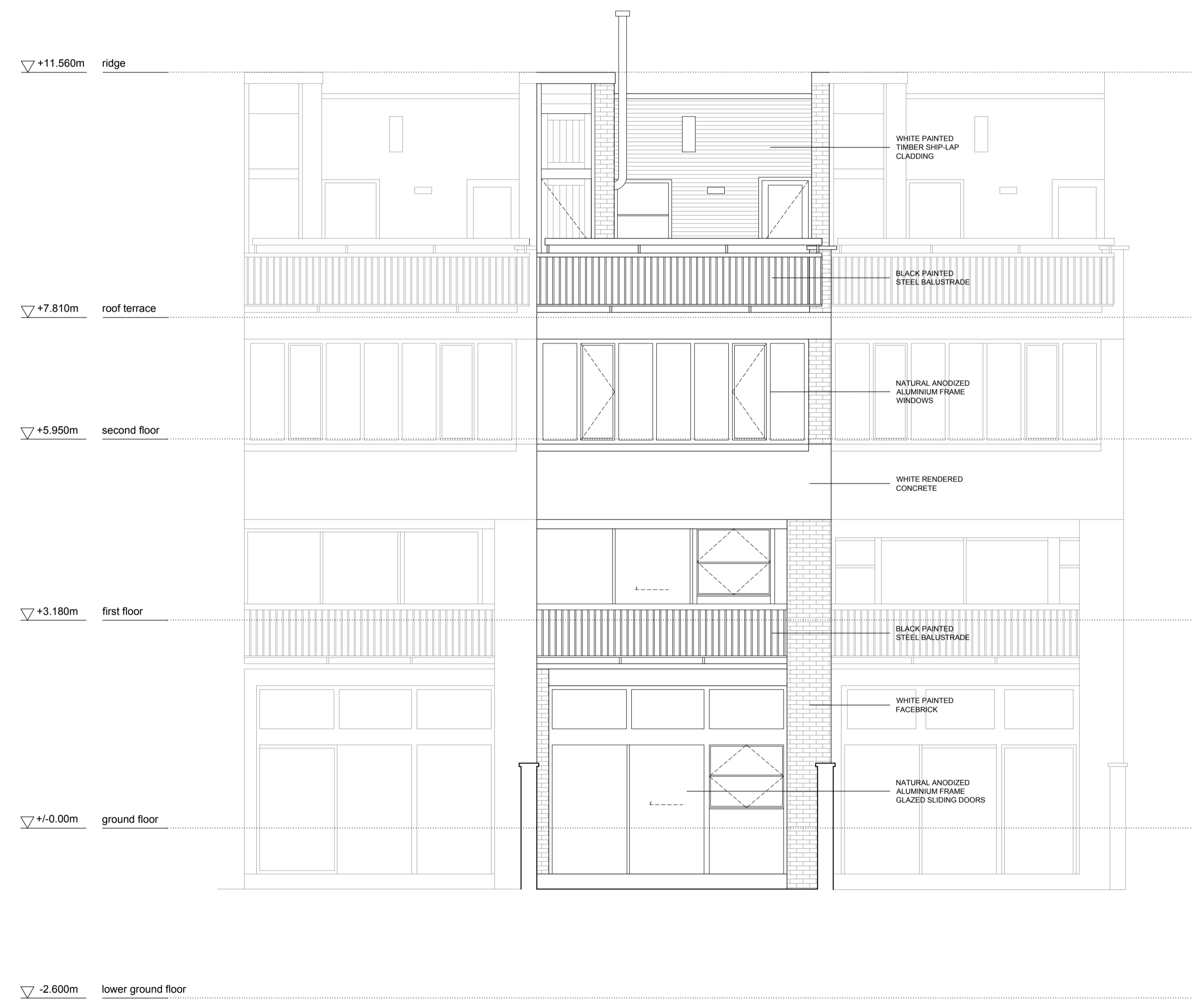
existing gayton crescent elevation