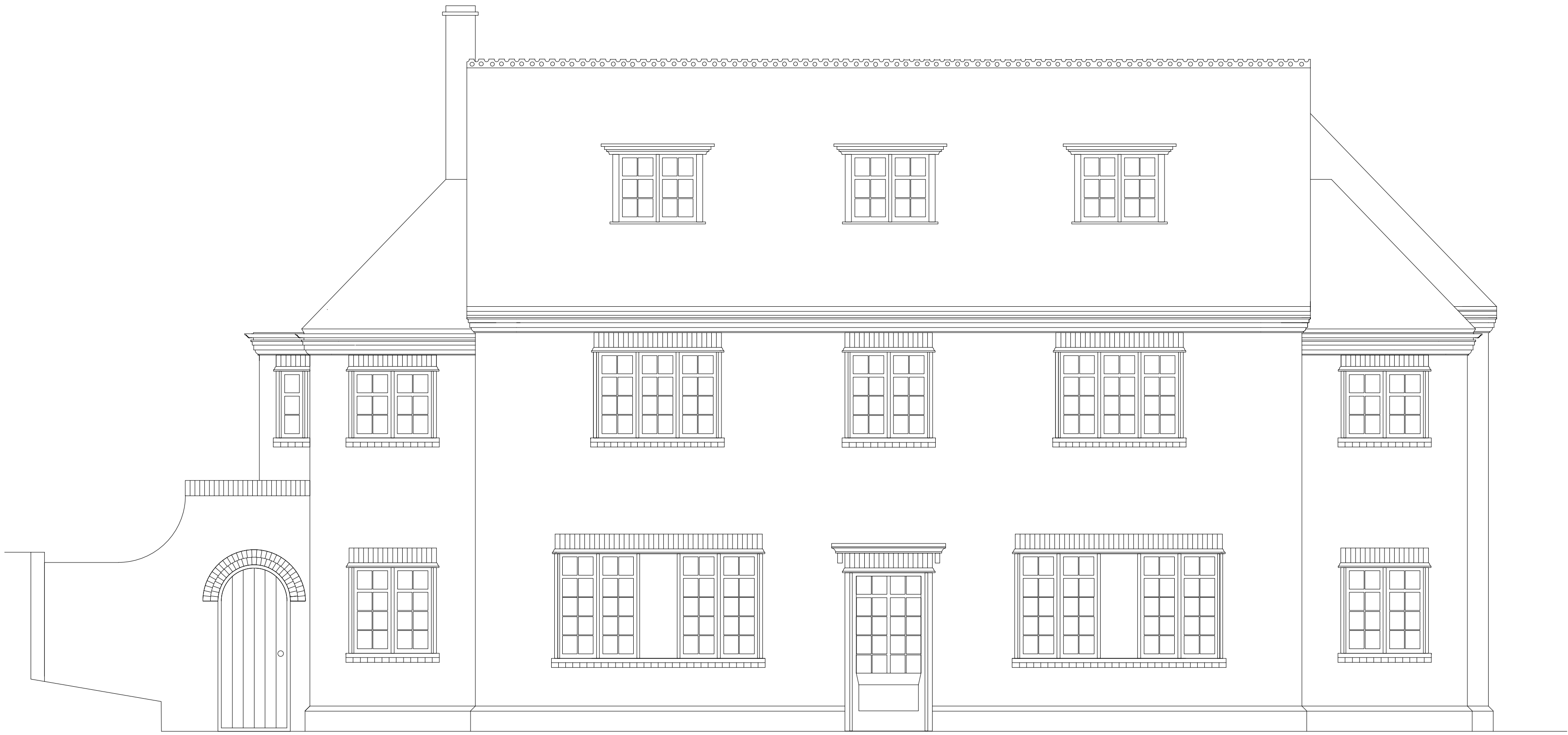
1 Front Elevation as Submitted October 2020 Scale: 1:50