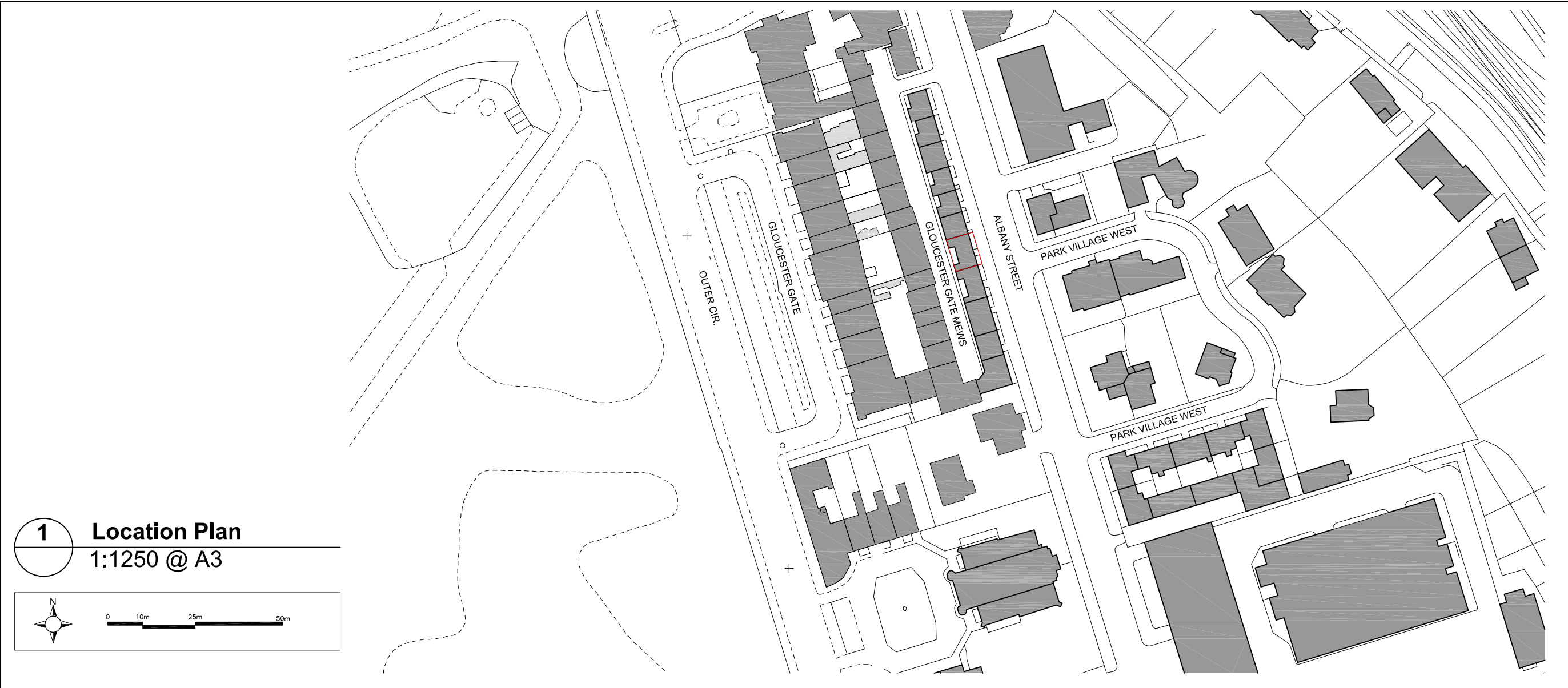
1 Location Plan 1:1250 @ A3 0 10m 25m 50m