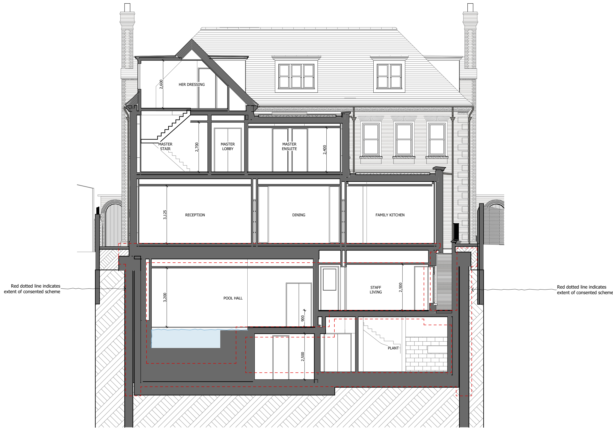
1 SCALE 1:100 @ A3 Proposed Section A-A