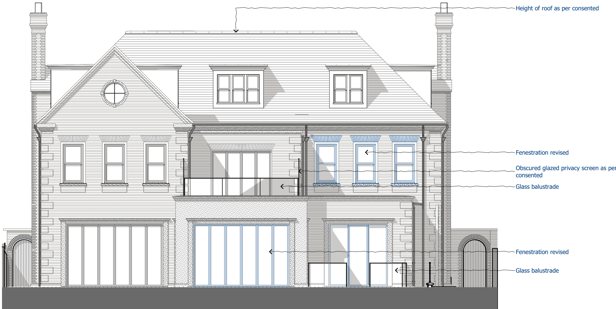
4 Proposed Rear Elevation - NE

Figured dimensions only are to be taken from this drawing. All dimensions are to be checked on site before any work is put in hand. If in doubt, ask.