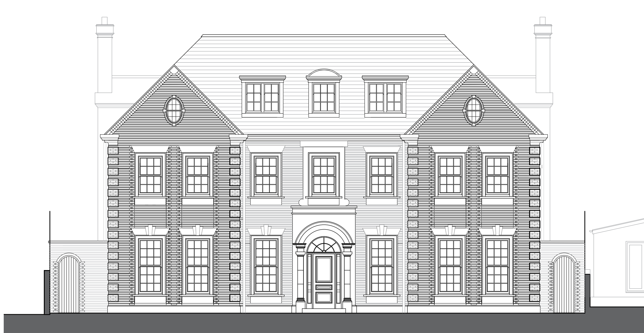
1 Consented Front Elevation - SW