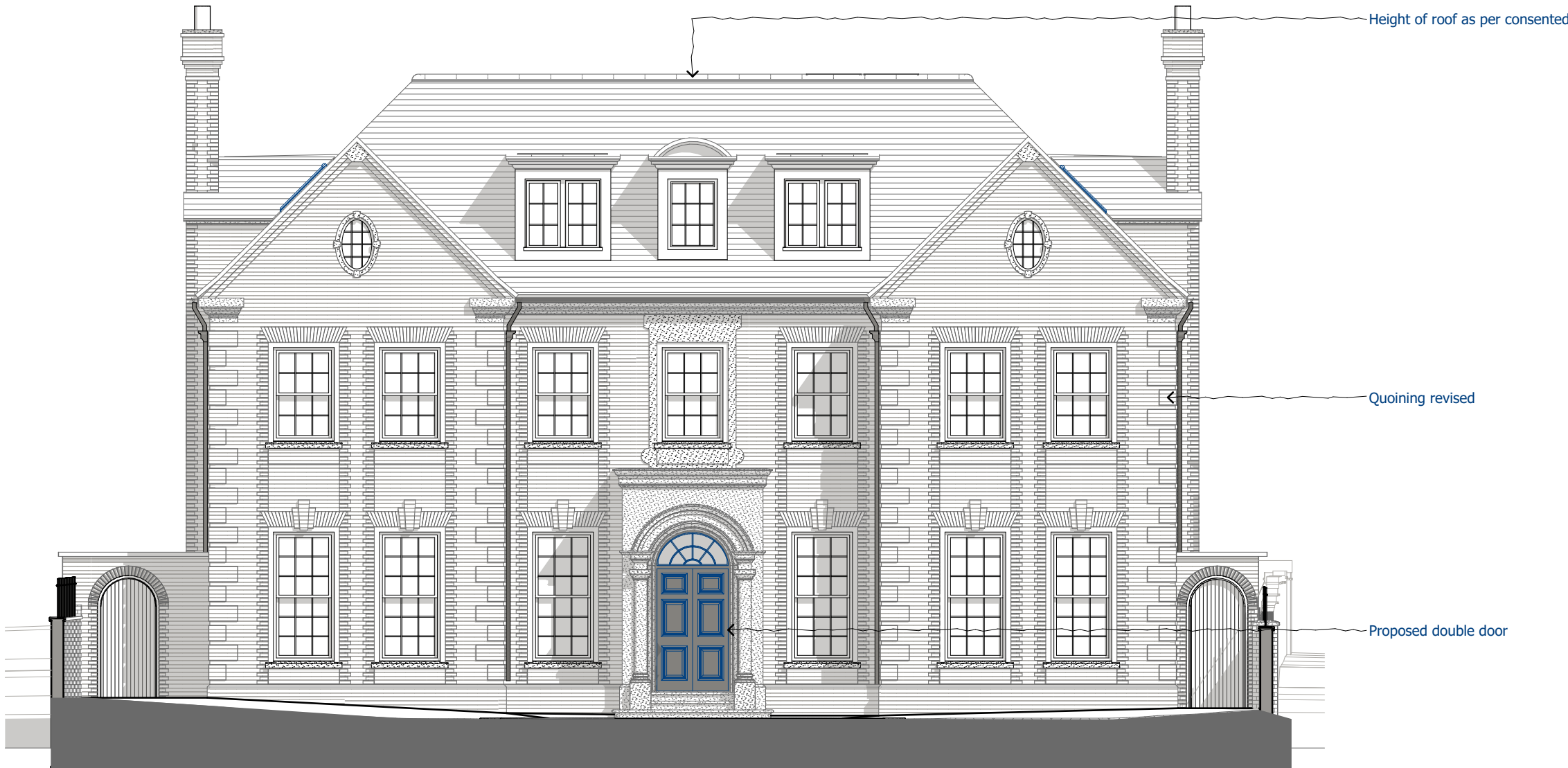
2 Proposed Front Elevation - SW