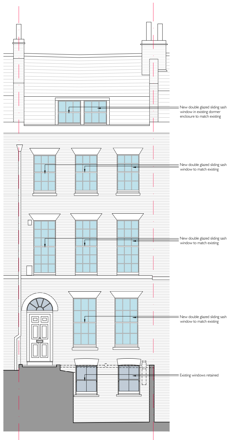
A 200 FRONT ELEVATION AS PROPOSED

DO NOT SCALE DRAWINGS. THE CONTRACTOR IS RESPONSIBLE FOR CHECKING DIMENSIONS & ANY DISCREPANCY IS TO BE REFERRED TO THE ARCHITECT.