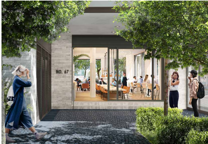
View from Poets park of 67WS

The image updated and associated references have been removed in Addendum document ( pg 7, April 2021). Updated image shows space without seating;