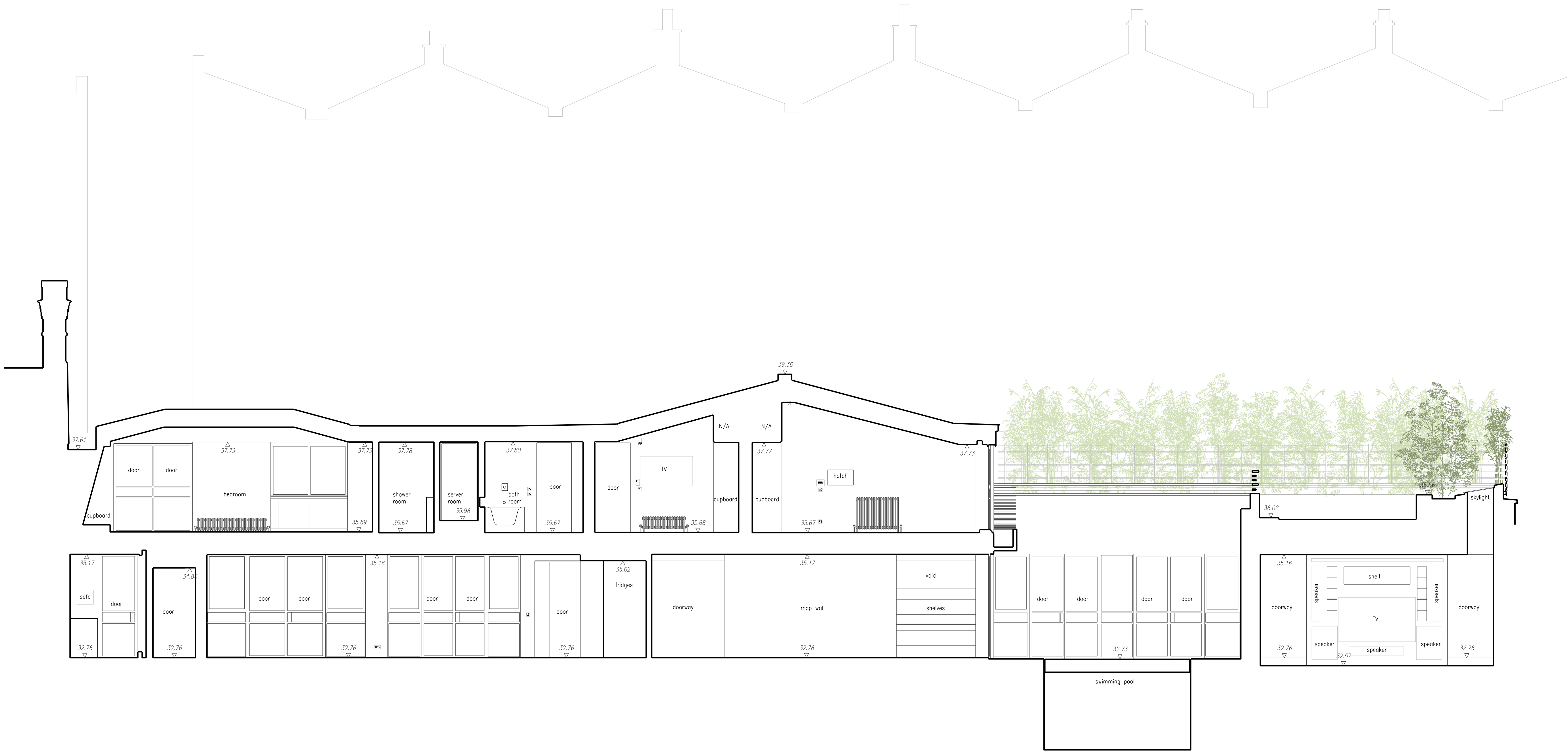
01 Section AA Scale 1:50 @ A1 / 1:100 @ A3