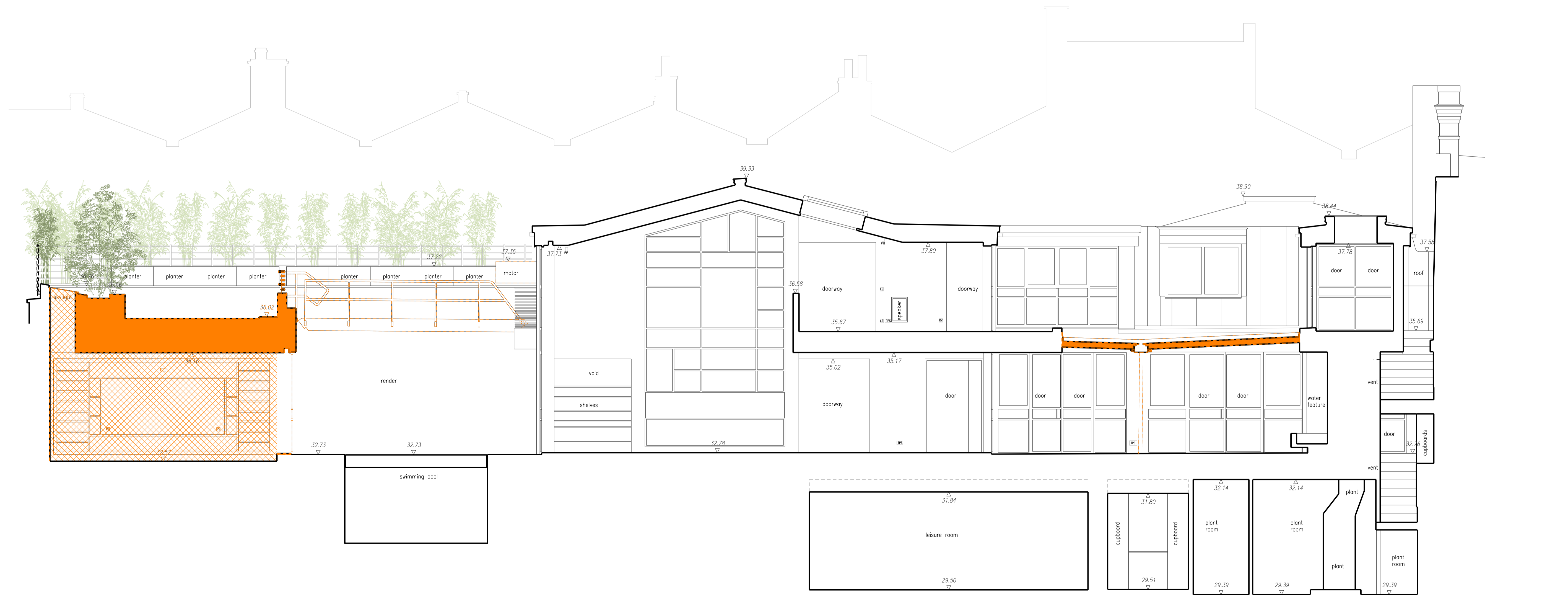
01 Section BB Scale 1:50 @ A1 / 1:100 @ A3

- this is a Colour Drawing; - all Demolition drawings to be read in conjunction with the proposed;