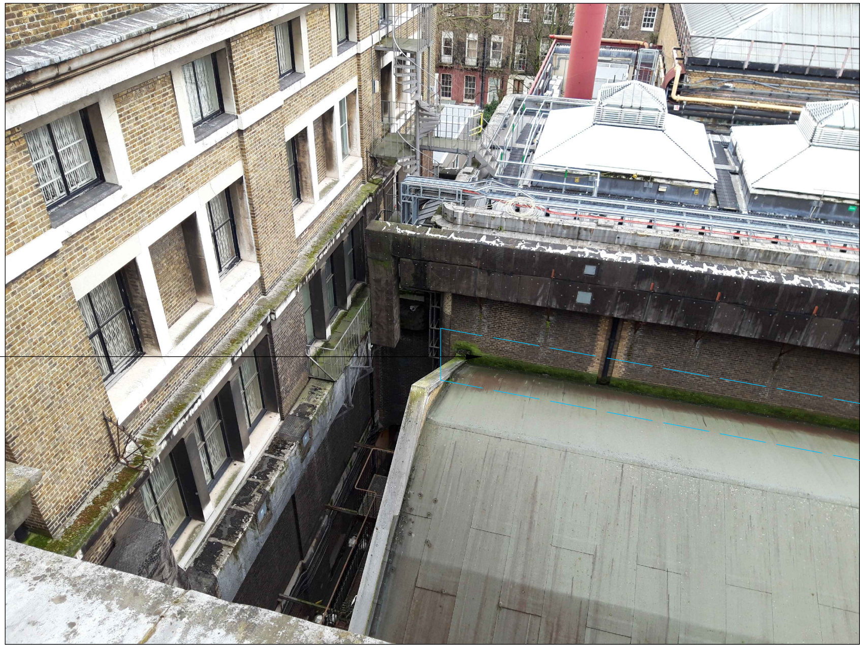
02 1005 Gallery 10 South End Photograph

Organic growth on wall along gutter line where there is currently no access