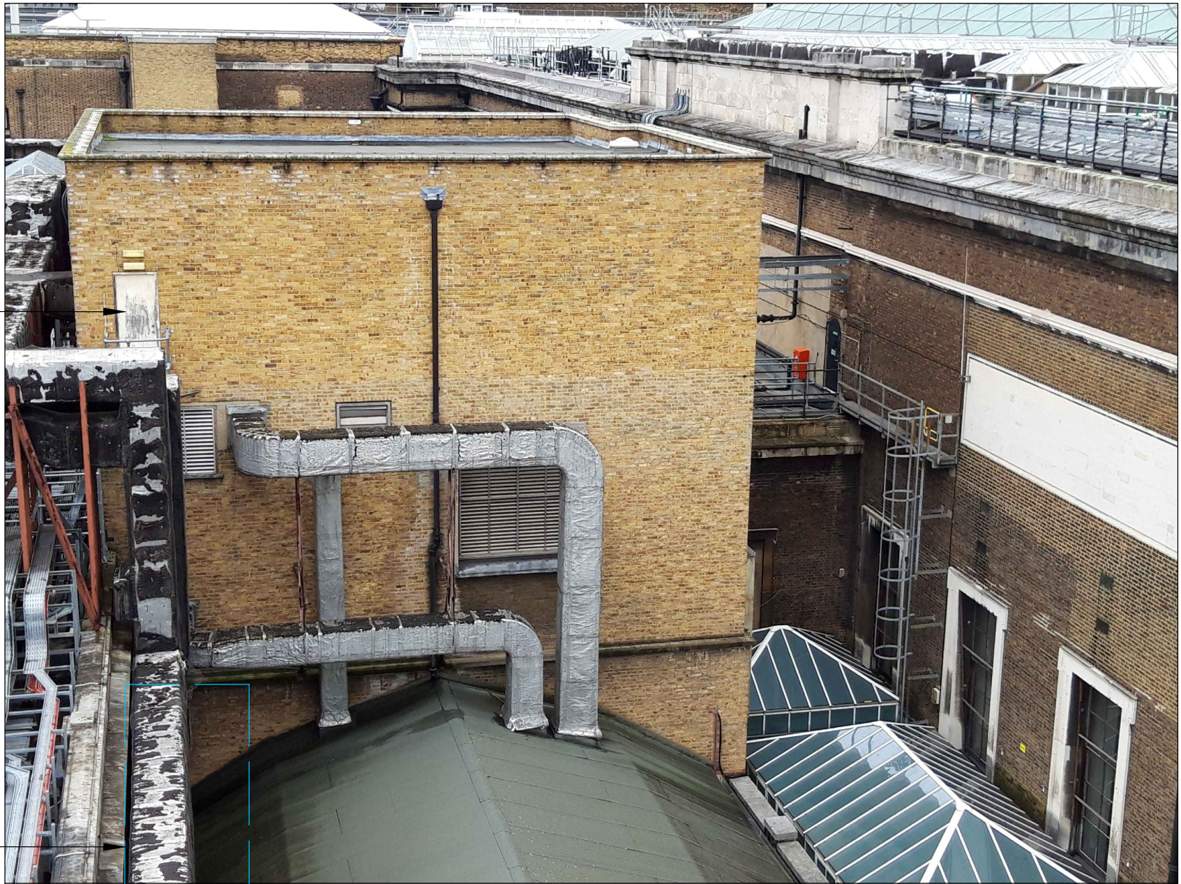
03 1005 Gallery 10 North End Photograph

Roof gutter that requires access for maintenance