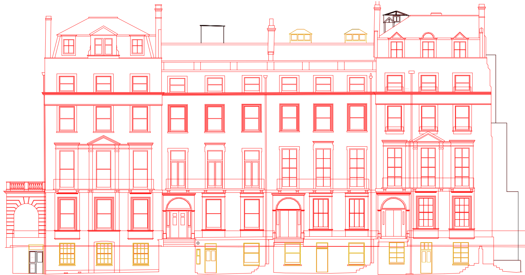
2 | Southeast Elevation

Copyright: All rights reserved. This drawing must not be reproduced without permission. This drawing must not be scaled. Dimensions are in millimetres unless specified.