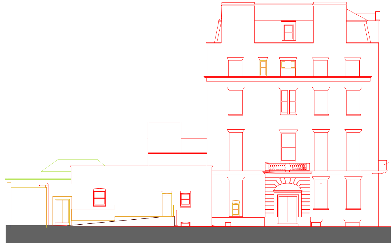
3 | Southwest Elevation