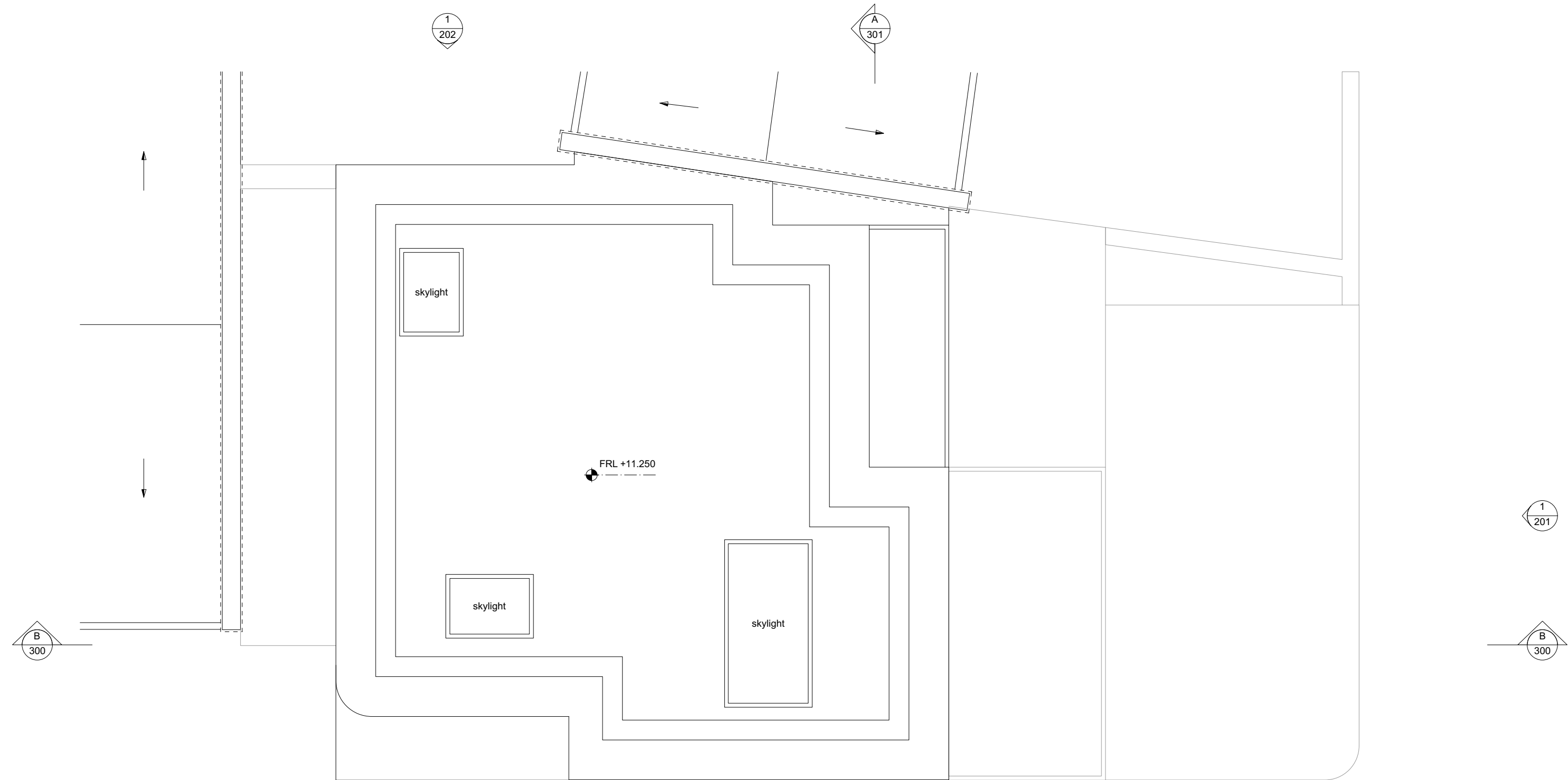
1 PROPOSED ROOF PLAN 1:50@A3