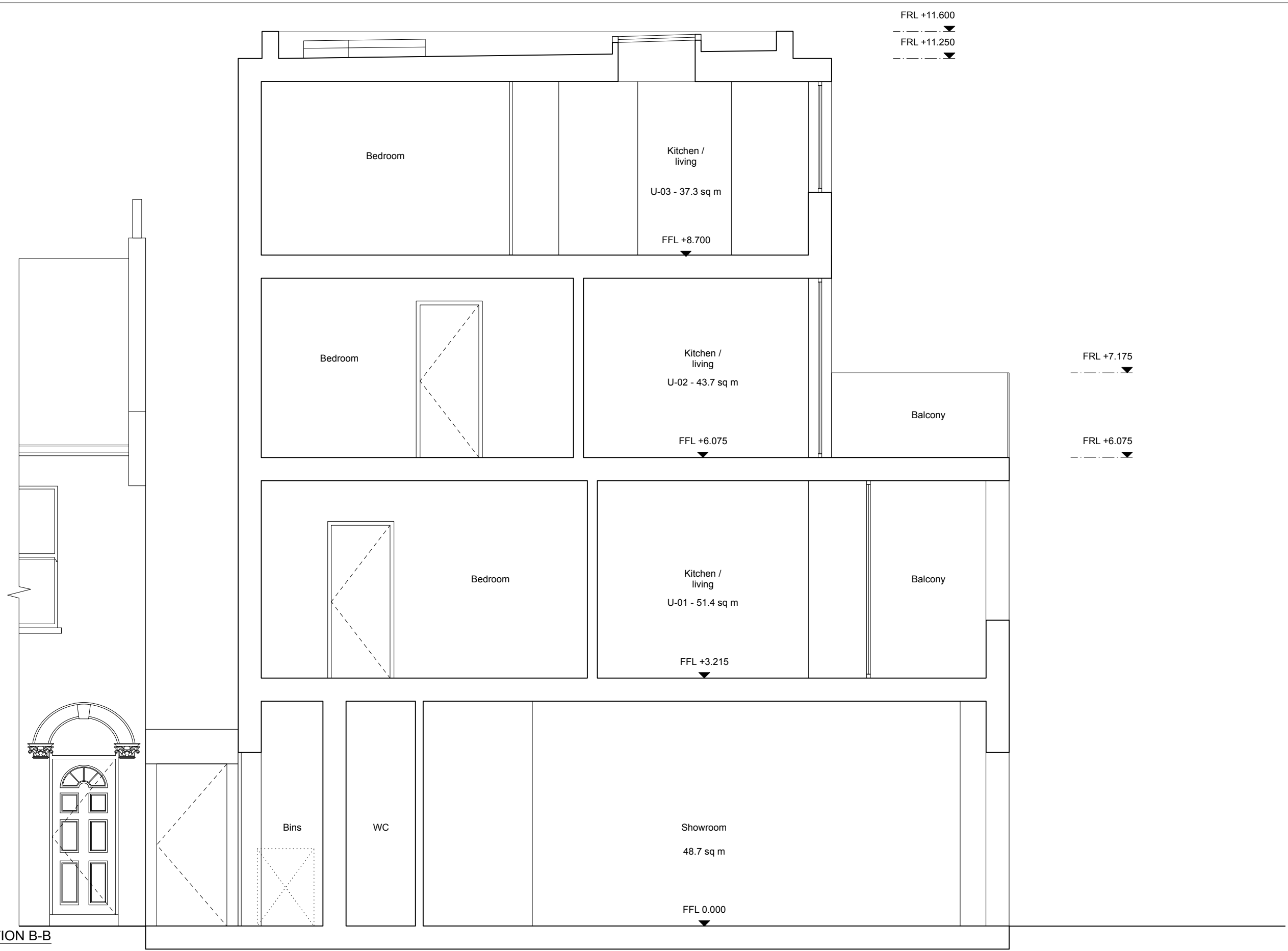
1 PROPOSED SECTION B-B 1:50@A3