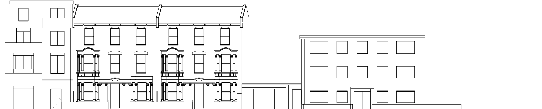
2 PROPOSED STREET ELEVATION - AGAR GROVE 1:200@A3