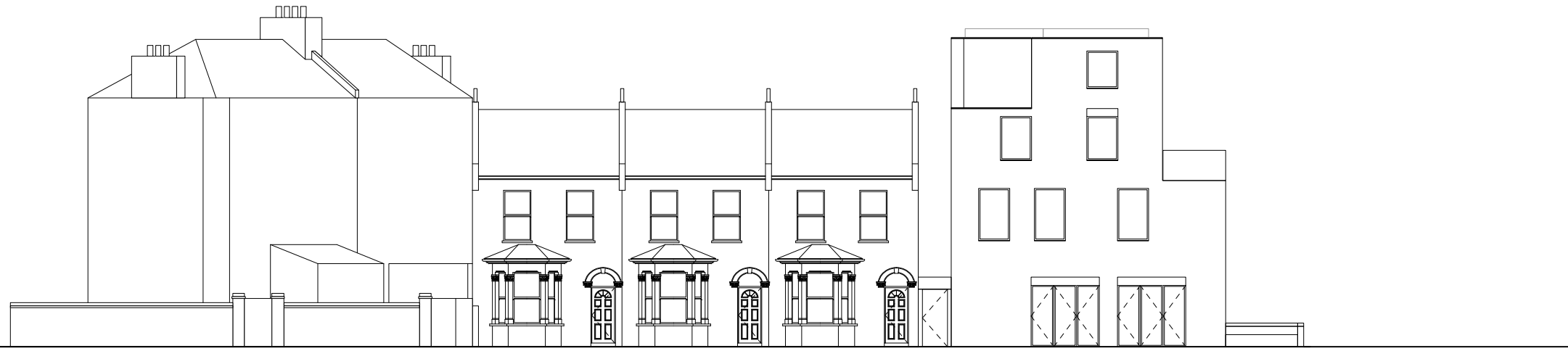
1 PROPOSED STREET ELEVATION - AGAR PLACE 1:200@A3