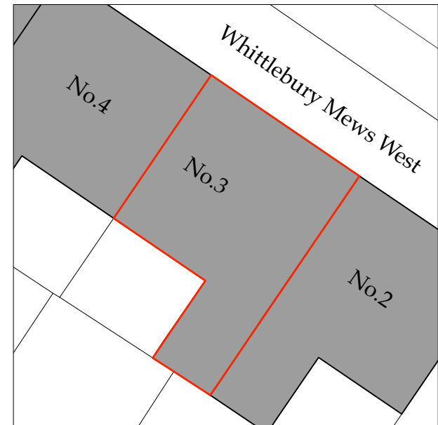
2 Site Plan Scale: 1:200