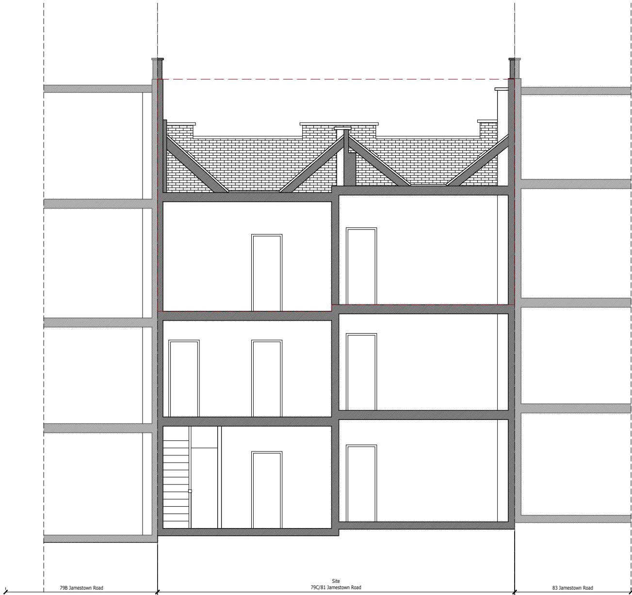
Existing Section A-A Scale 1:100

All information within this drawing are copyright of Squareplus Architects Ltd. and it is not to be reproduced without permission. No Implied licence exists. This drawing not to be used for land transfer or valuation purposes. Do not scale from this drawing. All dimensions and levels are to be checked on site by contractor . Issued for purposes indicated only. Drawing errors and omissions to be reported to architect or project manger immediately