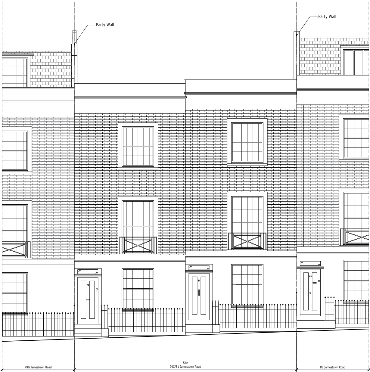
Existing Front-South Elevation Scale 1:100