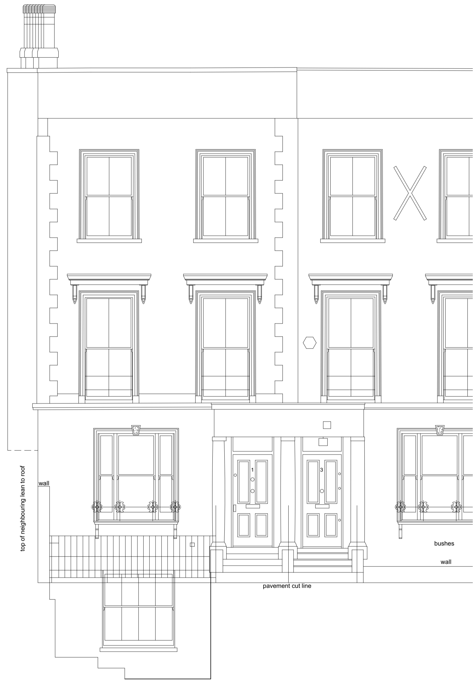
① EXISTING FRONT ELEVATION 1:100 @ A3