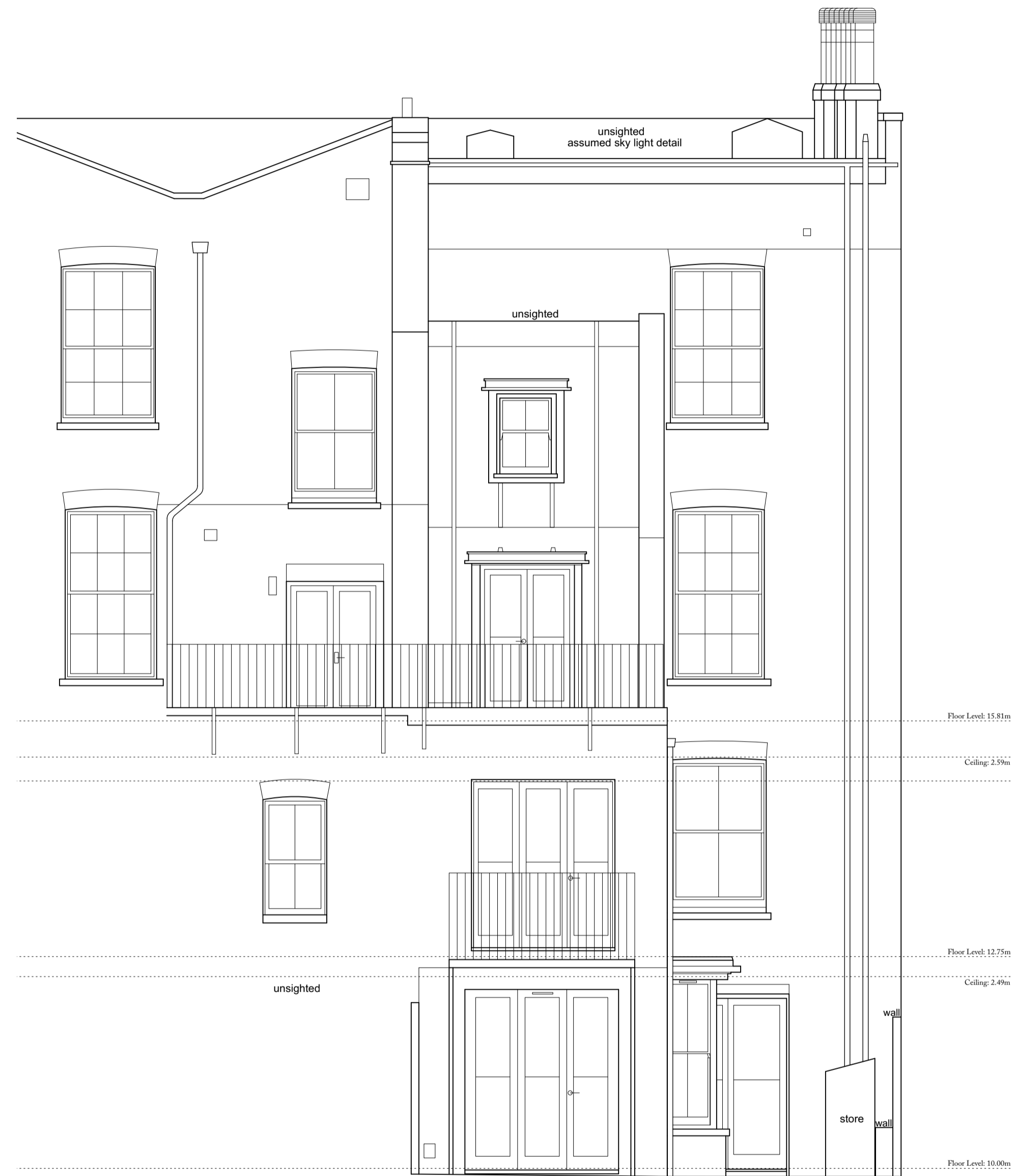
② EXISTING REAR ELEVATION 1:100 @ A3