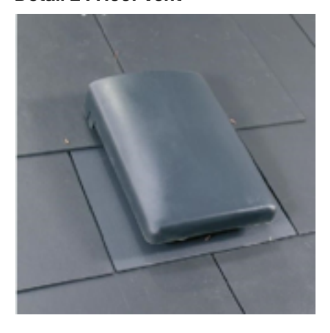
Detail 2: Roof Vent

MEV Spider is a low energy, continuous mechanical extract ventilation system designed with multiple extract points to simultaneously draw air out of room generating moisture, whilst minimising the migration of humidity to other rooms. From the unit there is a single exhaust point, thereby reducing the need for penetrations to the external envelope.