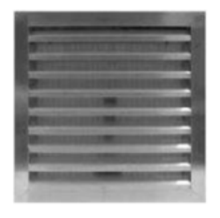
Detail 3: Louvres