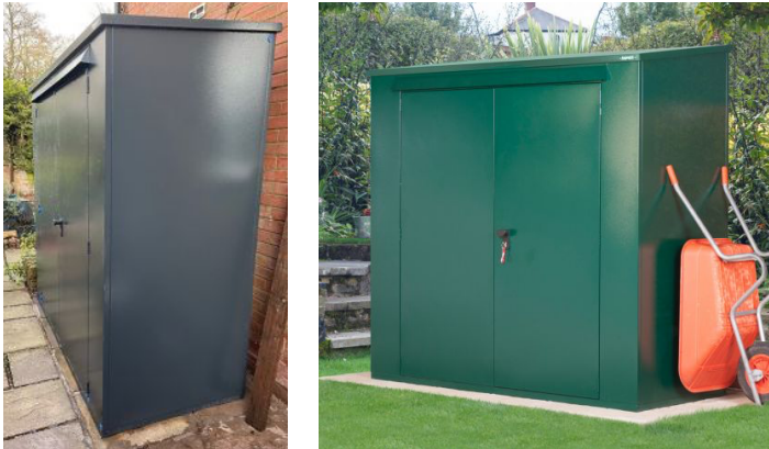
Proposed 7ft2 wide x 3ft1 deep x 6ft9 high Asgard metal shed, Colour: Grey.