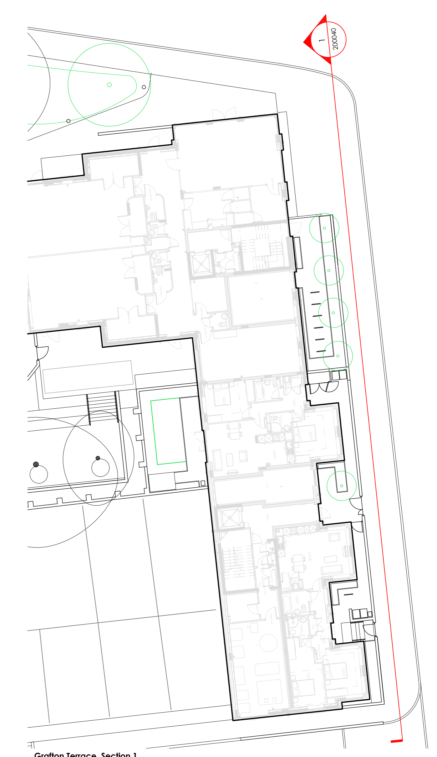
Grafton Terrace Section 1 Location Plan 1:200