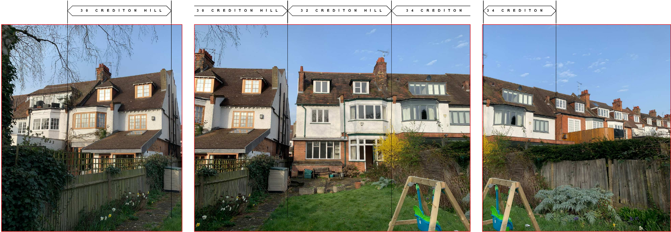
1 REAR ELEVATION - AS EXISTING