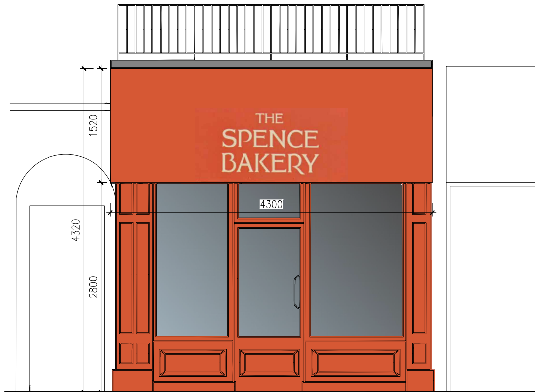
EXISTING SHOP FRONT ELEVATION 1:50@A3