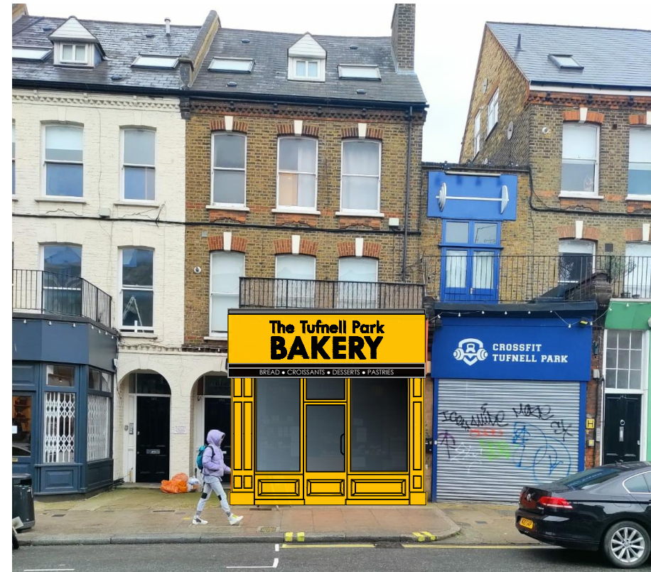
PROPOSED STREET VIEW