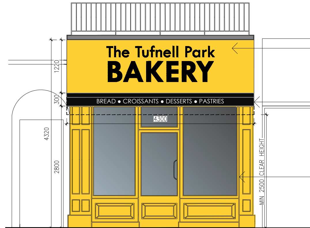
PROPOSED SHOP FRONT ELEVATION 1:50@A3

Existing fascia to be replaced with the new of the same size. Colour yellow (PANTONE 7548C) to match shop front. Writing as shown