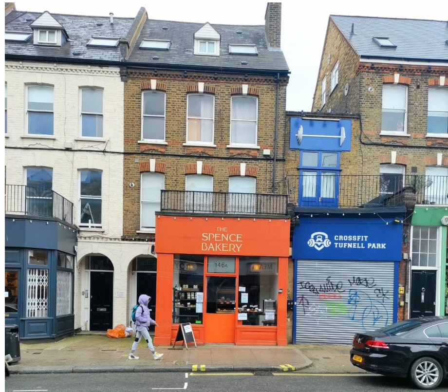
EXISTING STREET VIEW