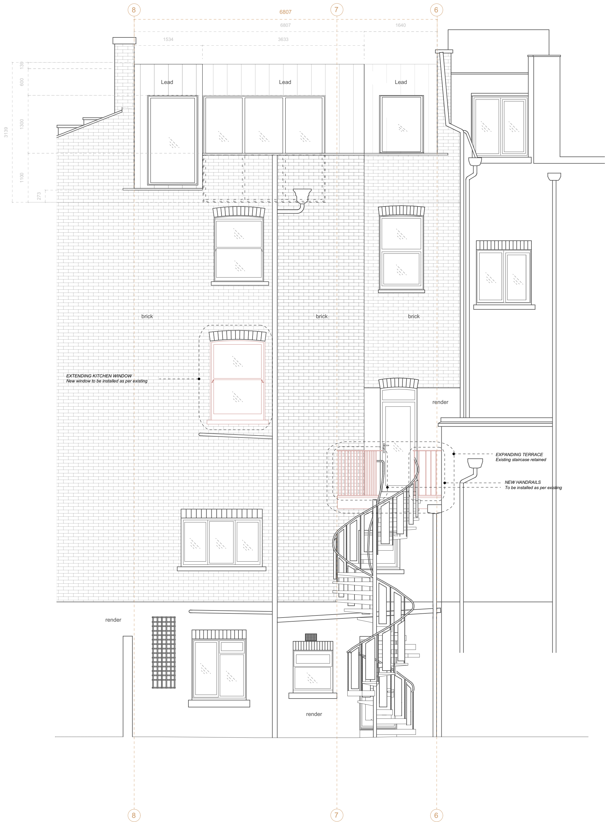
01 PROPOSED ELEVATION REAR 1:50 @ A1, 1:100 @ A3