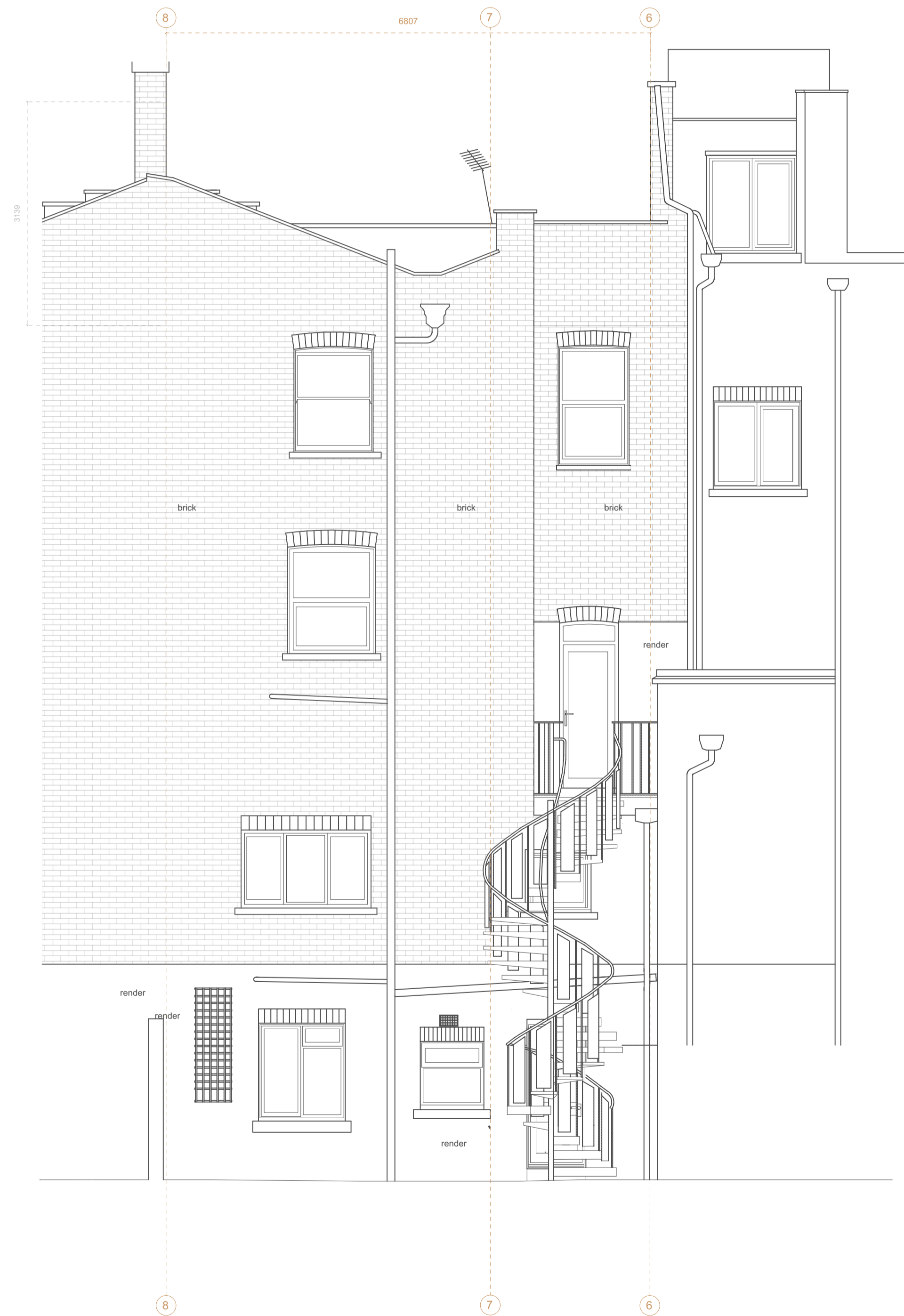
01 EXISTING ELEVATION REAR 1:50 @ A1, 1:100 @ A3