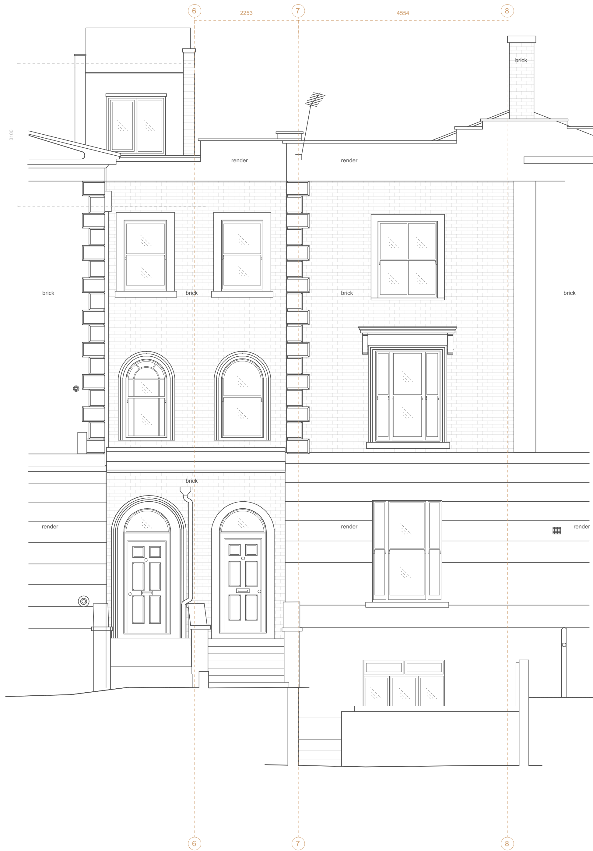
01 EXISTING ELEVATION FRONT 1:50 @ A1, 1:100 @ A3