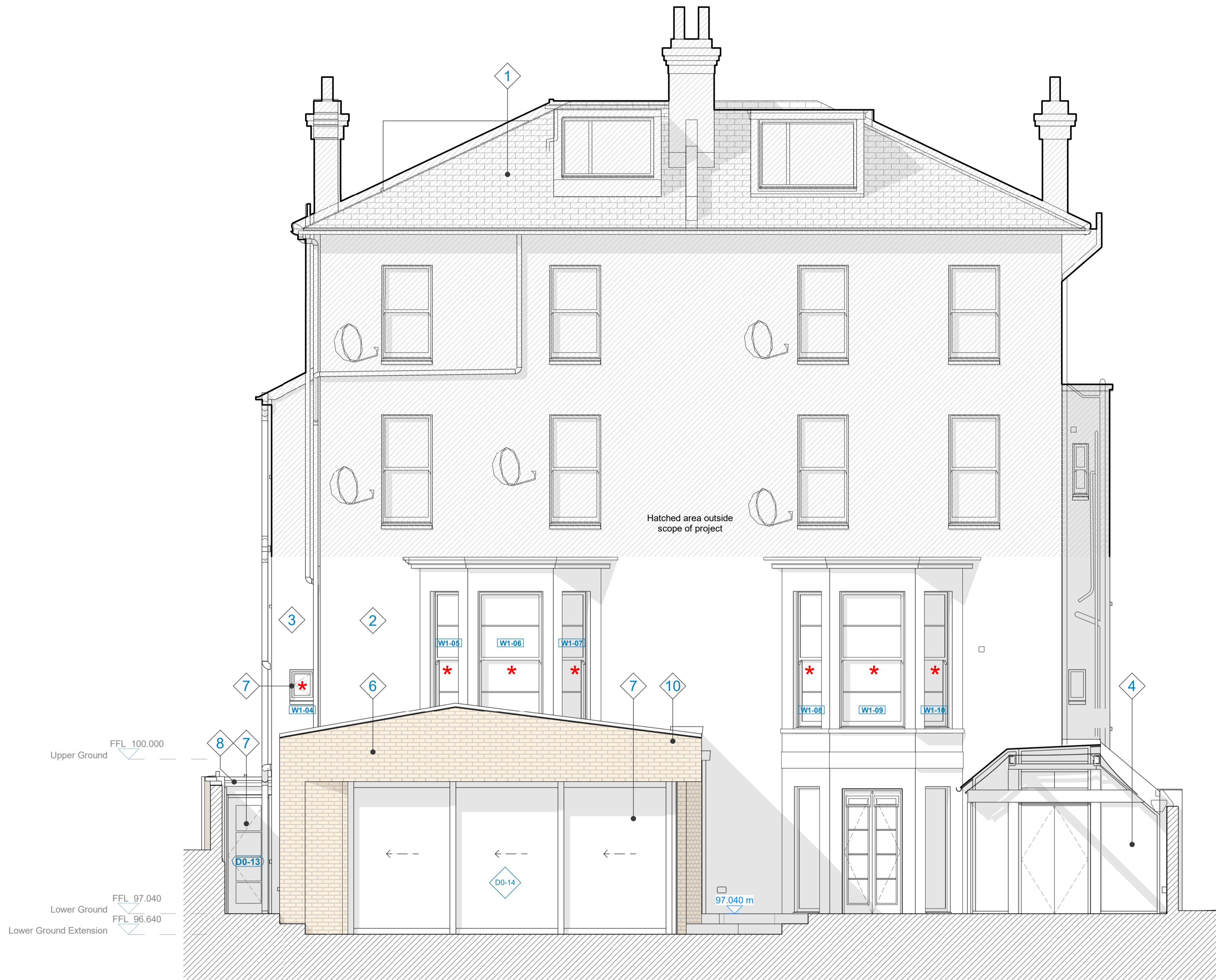
1 Proposed South Elevation 1 : 50