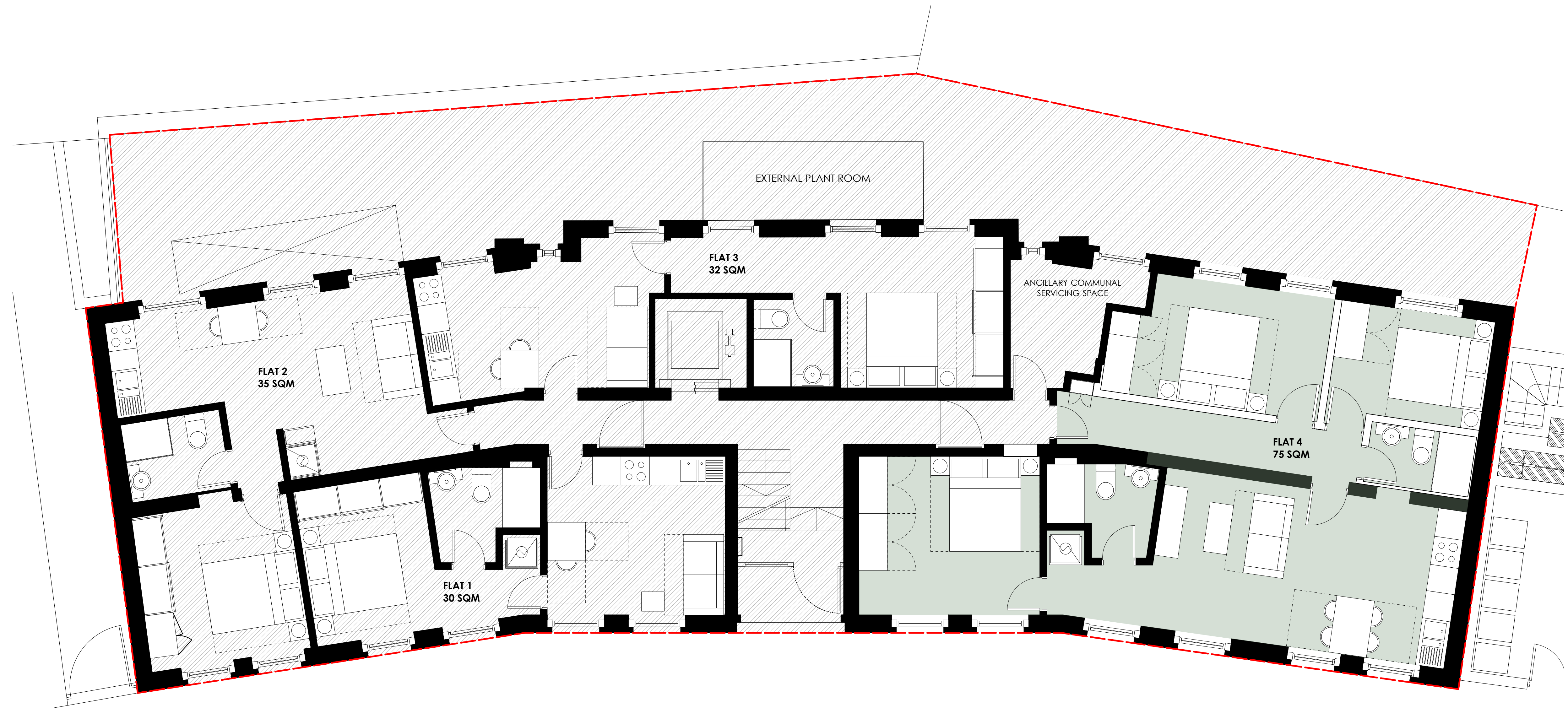
1 GROUND FLOOR - OPTION 1A 1:50