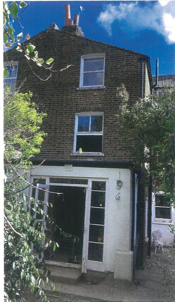
20a, AGAMEMNON ROAD, LONDON, NW6 1DY Supporting Information Sheet No. 1 - Site Photos. Planning Permission Application by: Hughes Design Associates, April 2021.