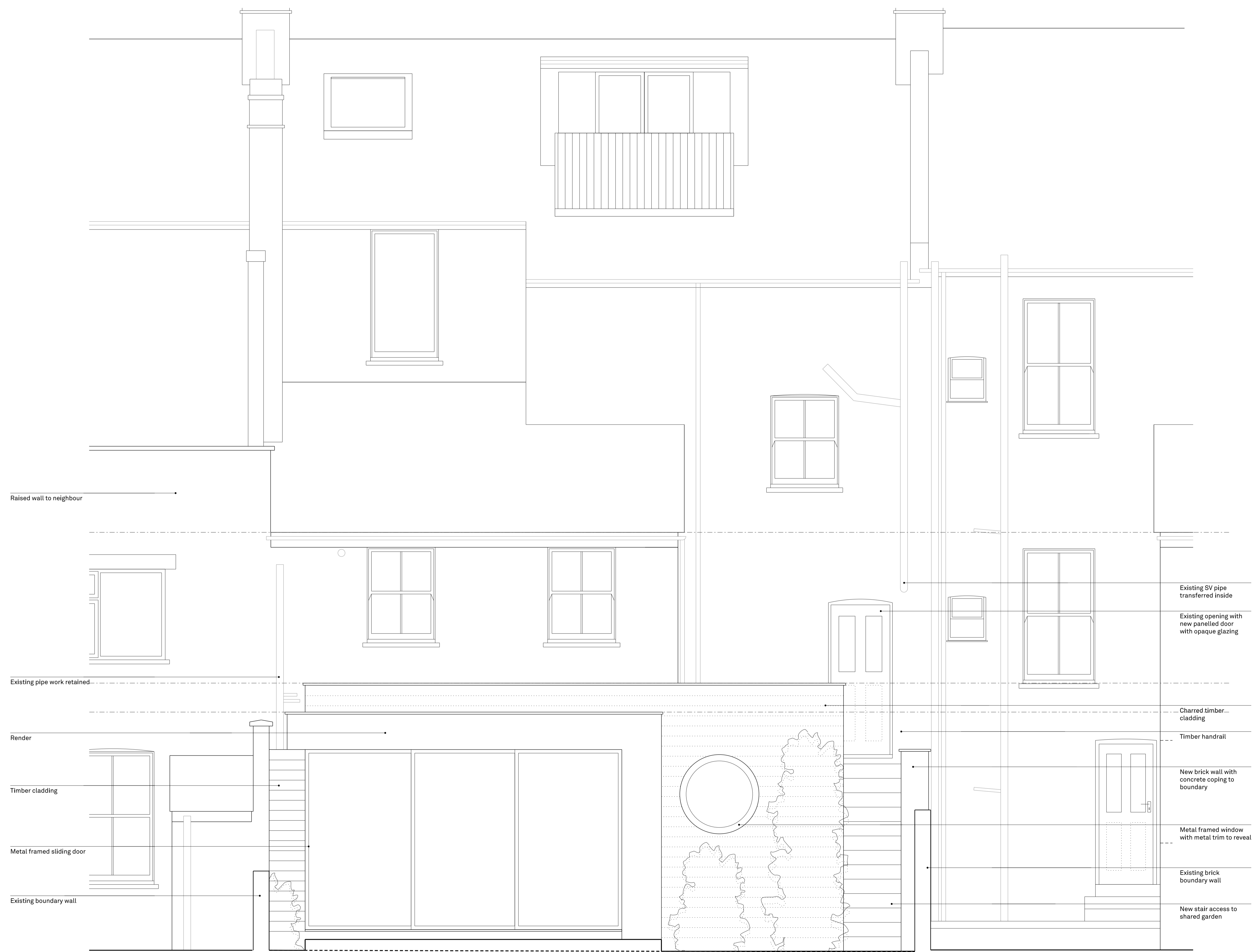
01 Rear elevation